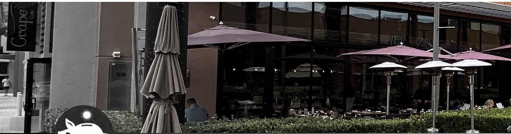
CV 5: A DIVERSE AND RESILIENT ECONOMY