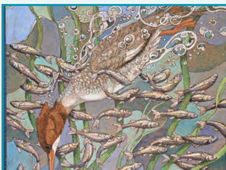
"Scatterplay" by Casey Alexander Southard

Featuring art by Casey Alexander Southard, Waterworks is a collection of pieces dealing with water as a subject or setting. In this show she concentrates on water as a shared resource with other animals and plants of earth. "I cannot think of a more appropriate setting for such a message than this beautiful Nevada park!" Exhibit: February 7 - April 25