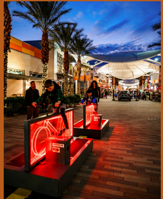
Light Lane in District F

Created by: LeMonde Studio and Recycled Propaganda