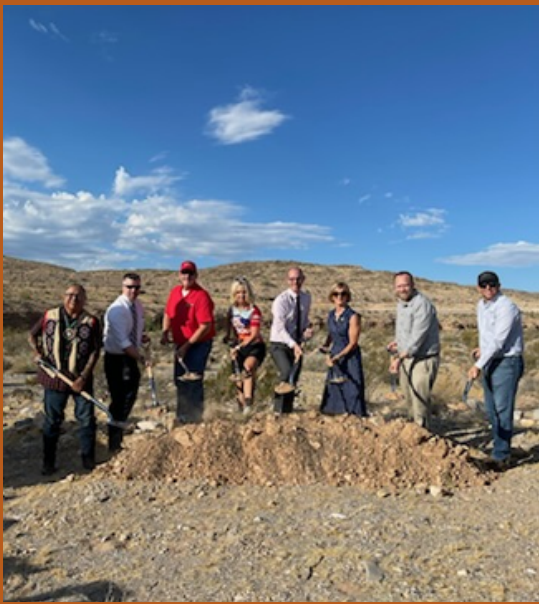
Legacy Trail Groundbreaking