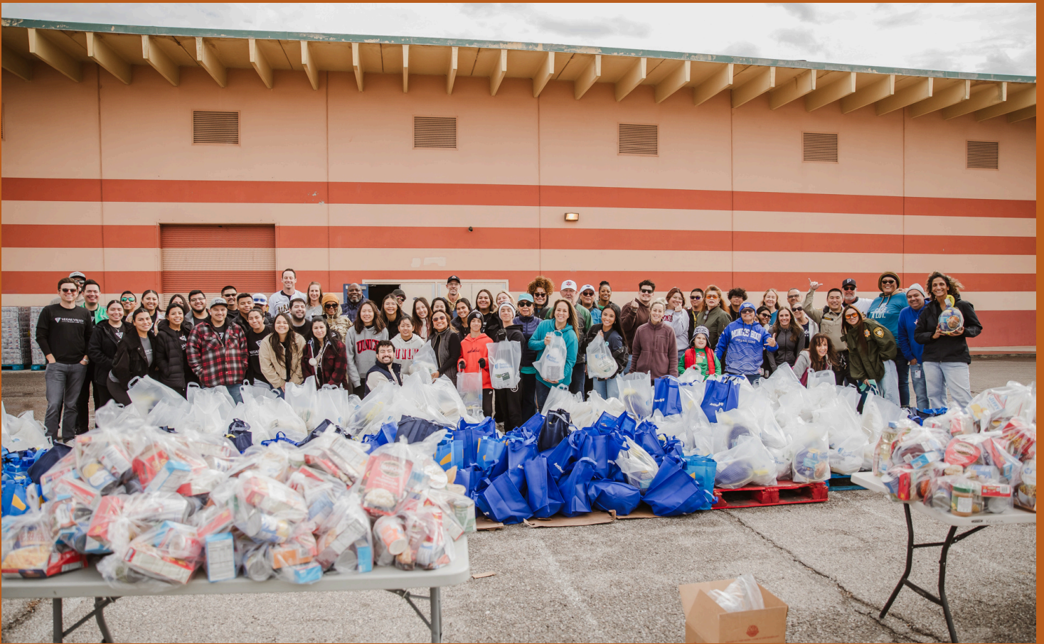
Back to School Teacher Event Gave out teachersupplies to 300 Title 1 District F Teachers. August 2025