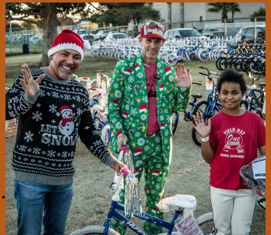
A Holiday to Remember at Cashman Park