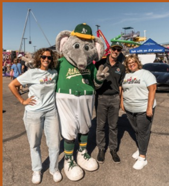
Mighty Motor Mania at Desert Breeze Community Center