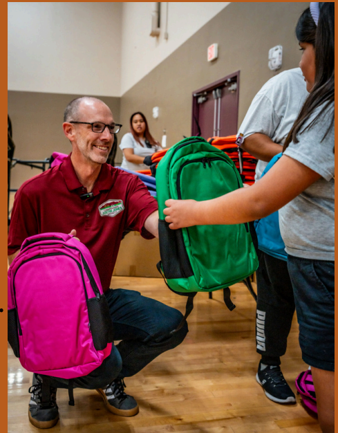
Back to School Student Event at Desert Breeze Community Center