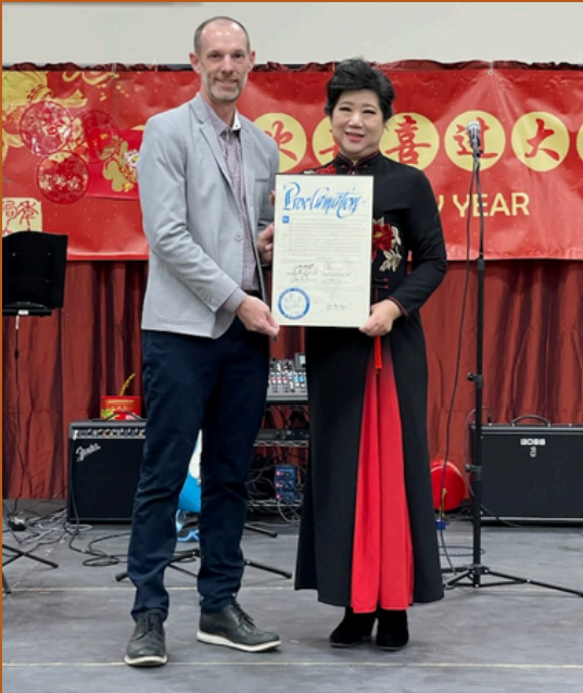
Spring Festival at Desert Breeze Community Center