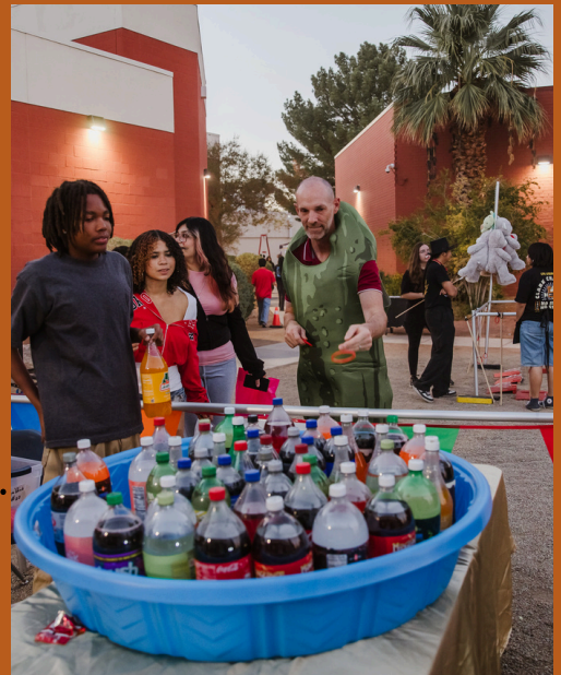
EPIC Halloween Trunk or Treat at Clark High School