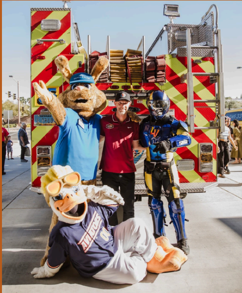
Fire Station 35 Open House