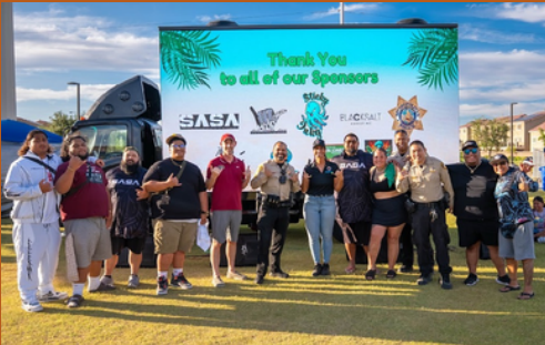
Movie Night at Battle Born Park