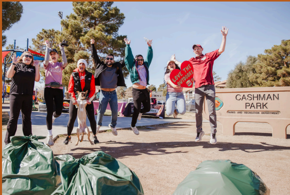
Valentine's Day Park Clean Up at Cashman Park