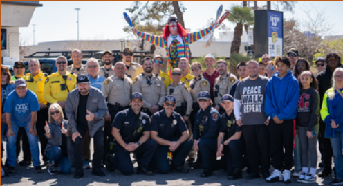
Peace Walk and Family Fun Festival at Cashman Park