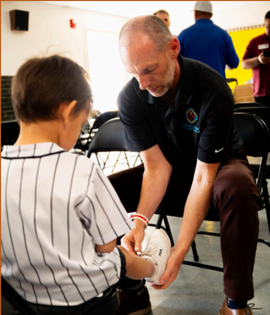
Shoes that Fit at Roger Bryan ES, William Wright ES and Sandy Valley ES