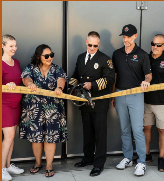
Fire Station 39 Grand Opening