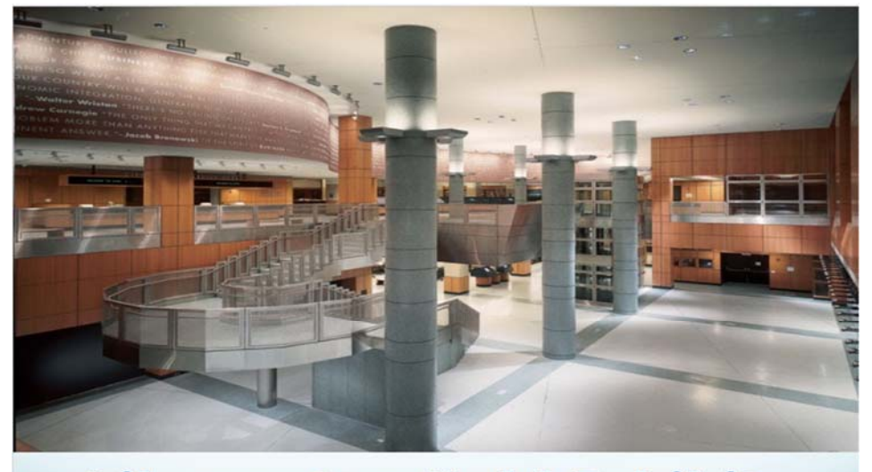
Library Can Hold Exhibits