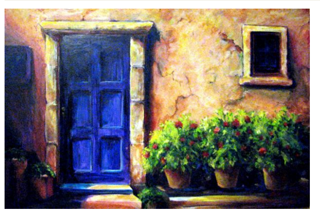
Exhibit at the Laughlin Library Gallery

*TAB = Town \ Advisory \ Board \ **For more information call the Laughlin Library at 702-507-4060