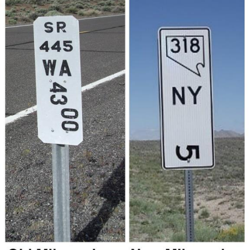
Old Milemarker New Milemarker

CC - Carson City EU - Eureka NY - Nye CH - Churchill HU - Humboldt PE - Pershing CL - Clark LA - Lander ST - Storey DO - Douglas LN - Lincoln WA - Washoe EL - Elko LY - Lyon WP - White Pine ES - Esmeralda MI - Mineral