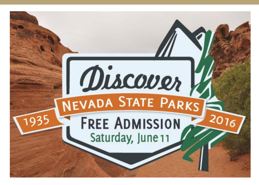
"Discover Nevada State Parks" Day Saturday, June 11 Free admission to all 23 State Parks

CARSON CITY, Nev. - Nevada residents and visitors are invited to "Discover Nevada State Parks" on Saturday, June 11. Park visitors will receive free day use admission and free fishing (no license required) at all of Nevada's 23 State Parks.