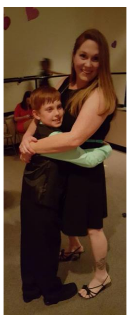
Crafty February Fun With Indian Springs Parks & Recreation