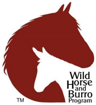
U.S. Department of the Interior Bureau of Land Management

There are also adoption events throughout the year in different parts of the country. https://www.blm.gov/programs/wild-horse-and-burro/adoption-and-sales/events One event that is right here in Nevada is the Northern Nevada Correctional Center Saddle-Trained Wild Horse Adoption. This program pairs inmates with wild horses for 120 days of gentling and training after which the horses are offered for adoption at events held 3 to 4 times a year. The next of these adoption events is scheduled for June 2, 2018 at the Carson City facility. More information about the program is available here: https://www.blm.gov/programs/wild-horse-and-burro/adoptions-andsales/adoption-centers/northern-nevada-correctional-center-horse-facility