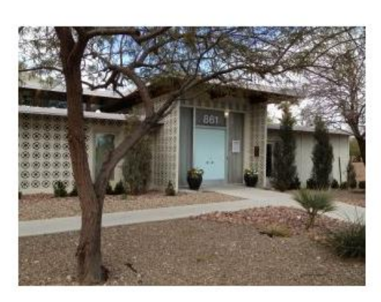
Interior of the Morelli House Today