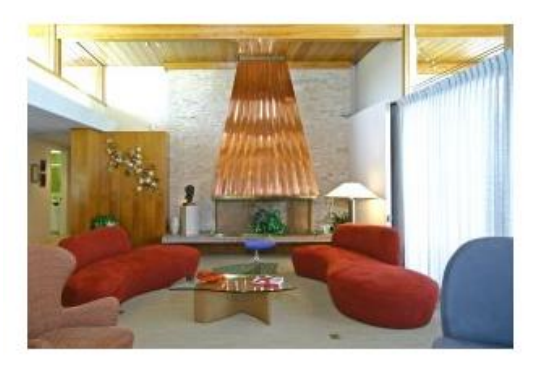
The Original Morelli House