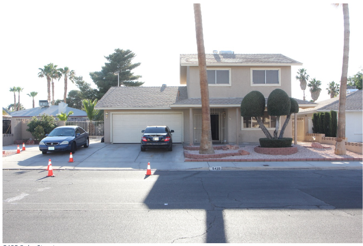
5435 Palm Street

This report is intended solely for the purpose of explaining why, based upon the facts known at this time, the conduct of the officers was not criminal. This decision, premised upon criminal-law standards, is not meant to limit any administrative action by the LVMPD or to suggest the existence or non-existence of civil actions by any person where less stringent laws and burdens of proof apply.