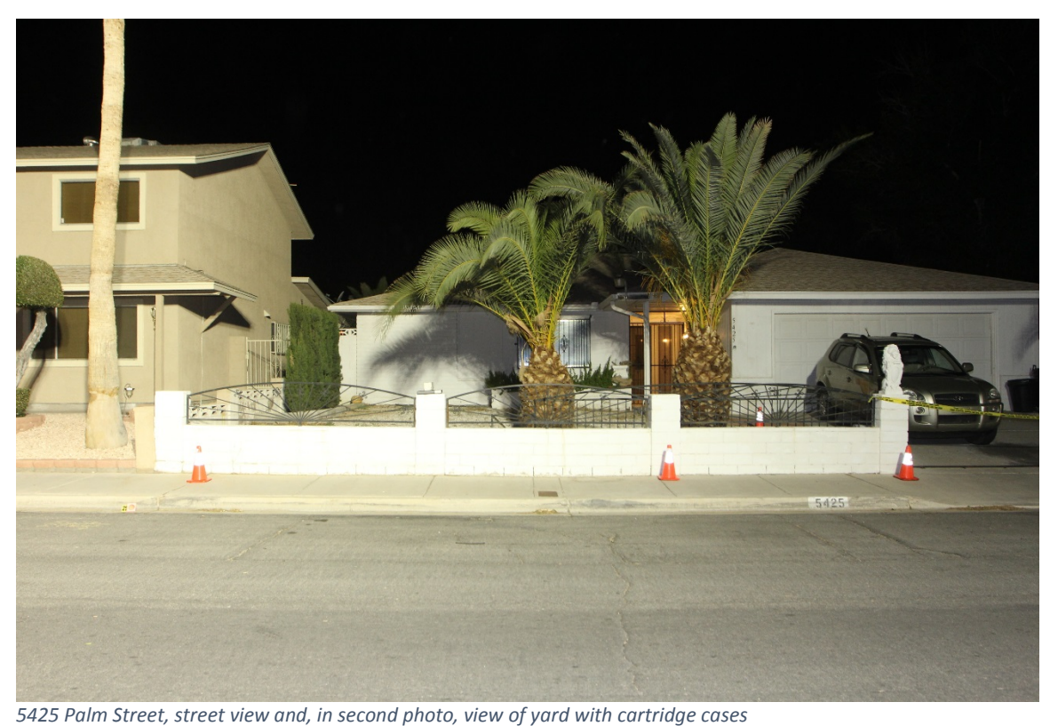
At 5425 Palm Street, a two story residence, seven cartridge cases were found in the front yard.