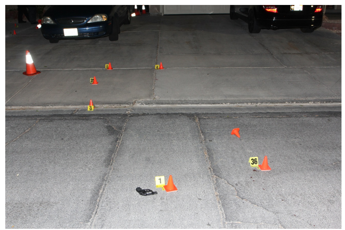
Driveway and street in front of 5435 Palm Street; gun that was in Decedent's possession

5442 Palm Street, another two story residence, had a bullet hole through the garage door. Investigators found a bullet on the garage floor.