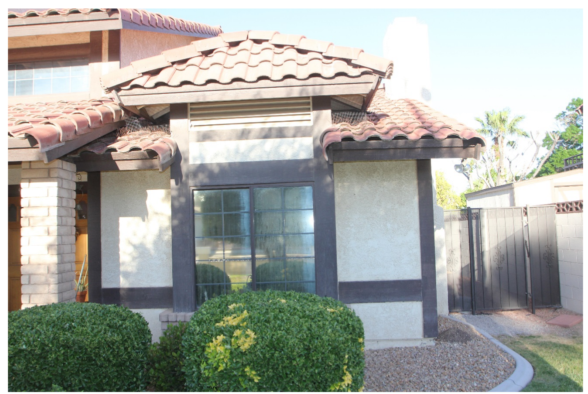
Bay window with bullet strikes