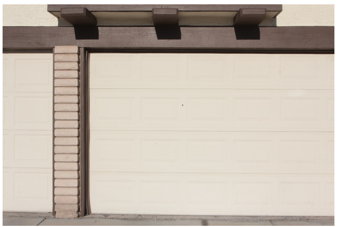
Bullet strike to garage door of 5442 Palm Street

5428 Palm Street, a two story residence, had two bullet impacts on either side of a bay window. Two other impacts were on a block wall.