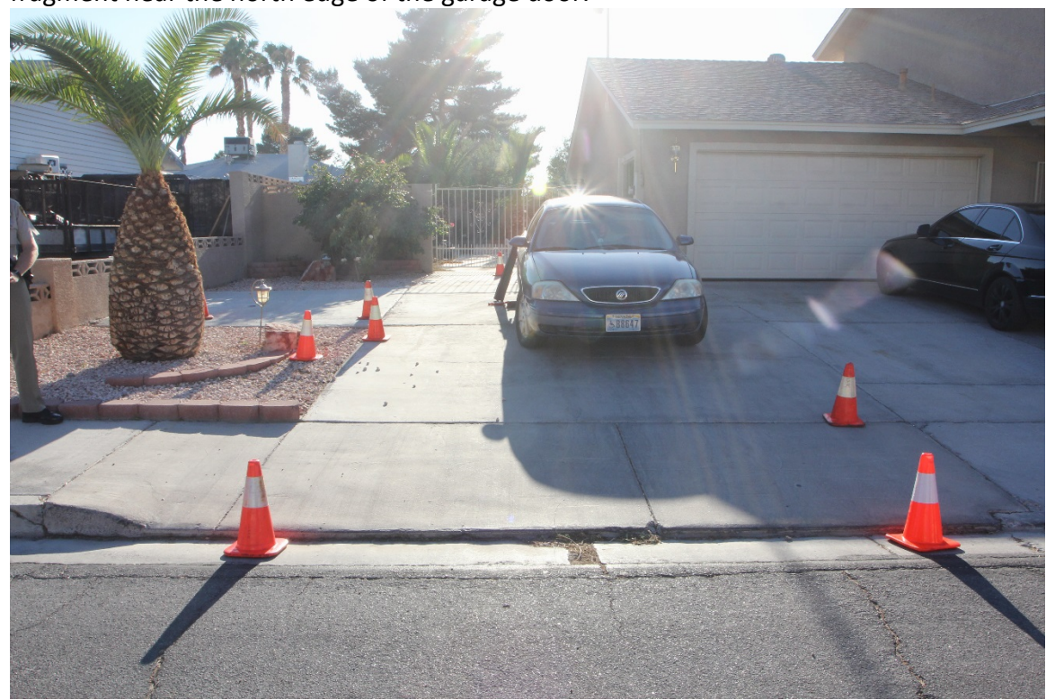
5435 Palm Street

Investigators found numerous pieces of evidence at 5435 Palm Street. These items included four cartridge cases near the backyard gate; seven cartridge cases on the landscaped planter at the southeast corner of the residence; a bullet in the driveway; four cartridge cases on the east edge of the driveway and west gutter; and a metal fragment near the north edge of the garage door.