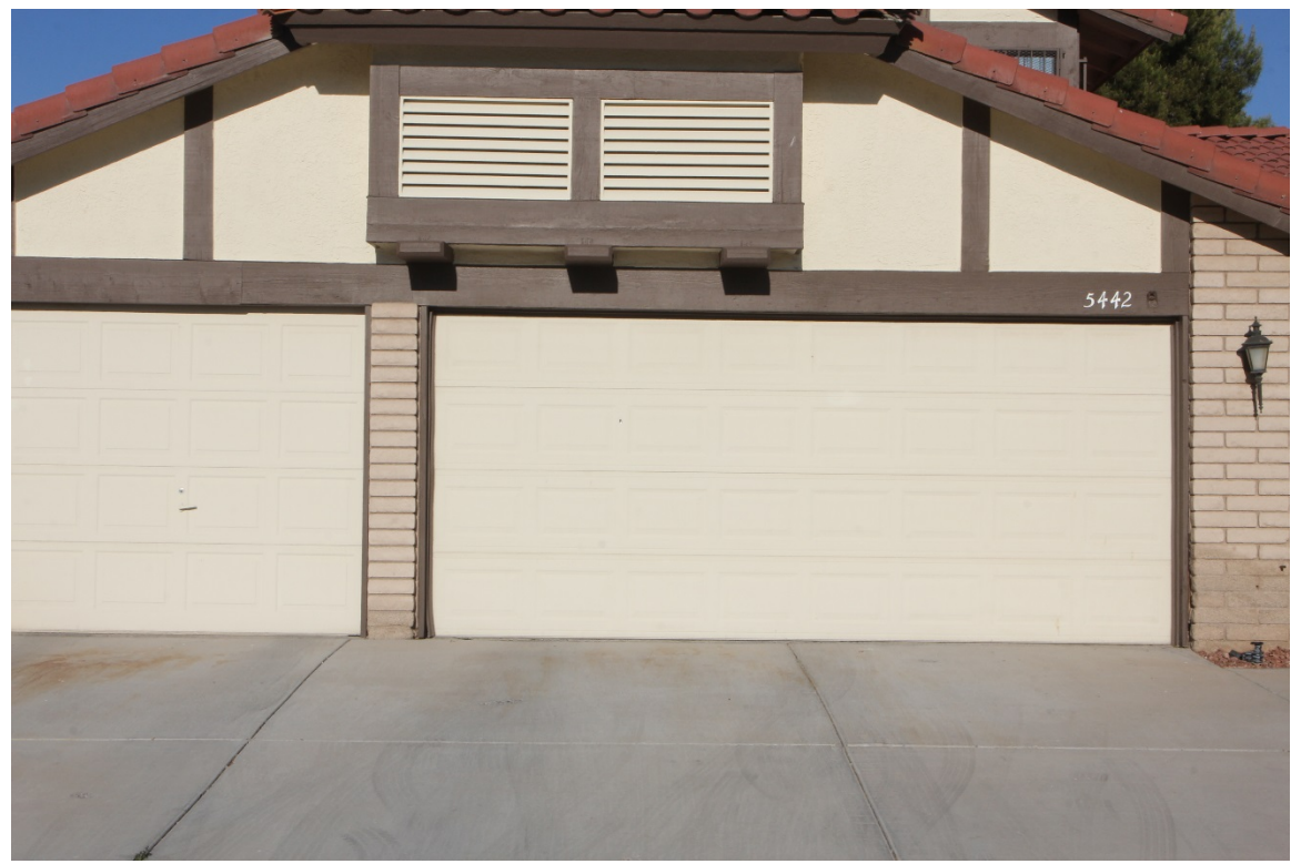
Garage of 5442 Palm Street