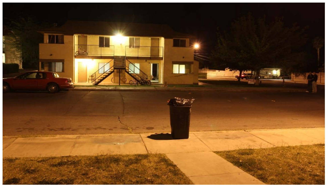
The viewpoint of citizen #2 as he looked out to the south of his apartment.