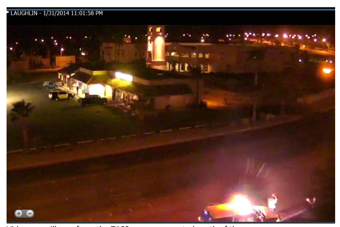
Video surveillance from the TASS camera mounted north of the scene