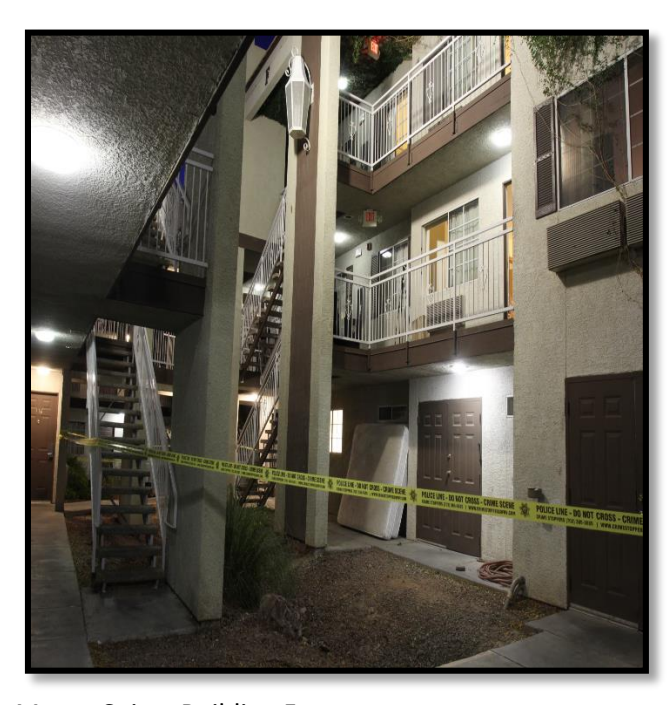
Manor Suites Building F.