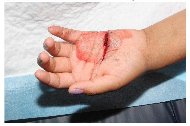
Witness #1's left palm laceration

Decedent then jumped over the fence into the pool area, and he continued to yell for someone to call 911. Decedent grabbed Witness #1 by her wrist and hair and said he was going to stab her. She feared for her life. Several of her family members surrounded Decedent. In an attempt to save her