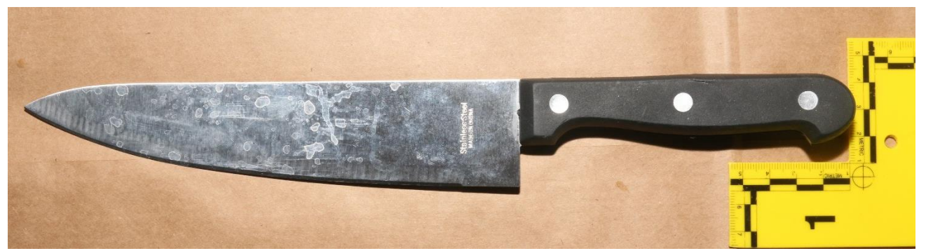
Decedent's knife used to attack Witness #1