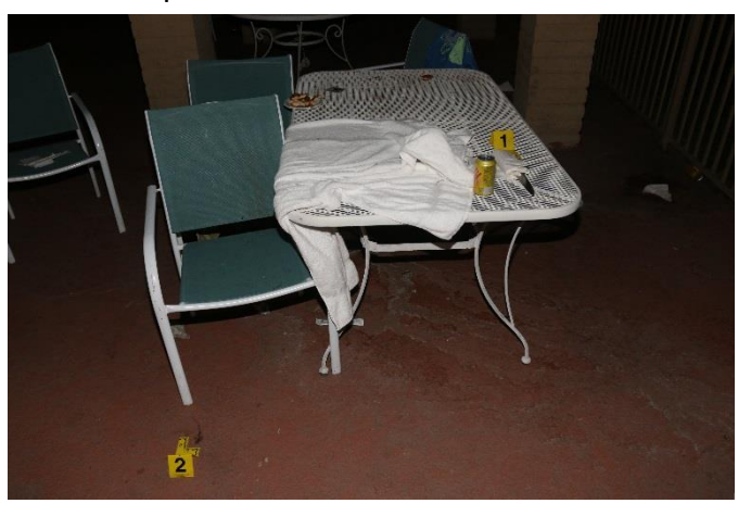
Table with Decedent's knife (1) and Witness #1's hair (2)

A rectangular table was north of the round table. Three chairs were east of the table and one was south of the table. A towel and a hat were atop a chair to the east side of the table.