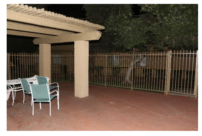
Pool Area where Decedent was restrained

situated north to south at the west end of the pool area. The pool was situated east of the pergola.