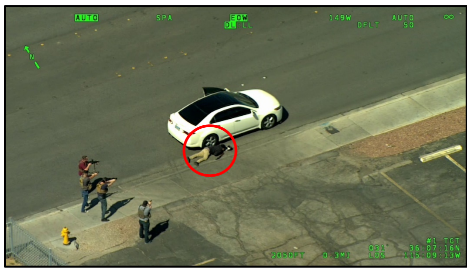
Image capture from AIR 5 after discharge; shotgun next to suspect on ground