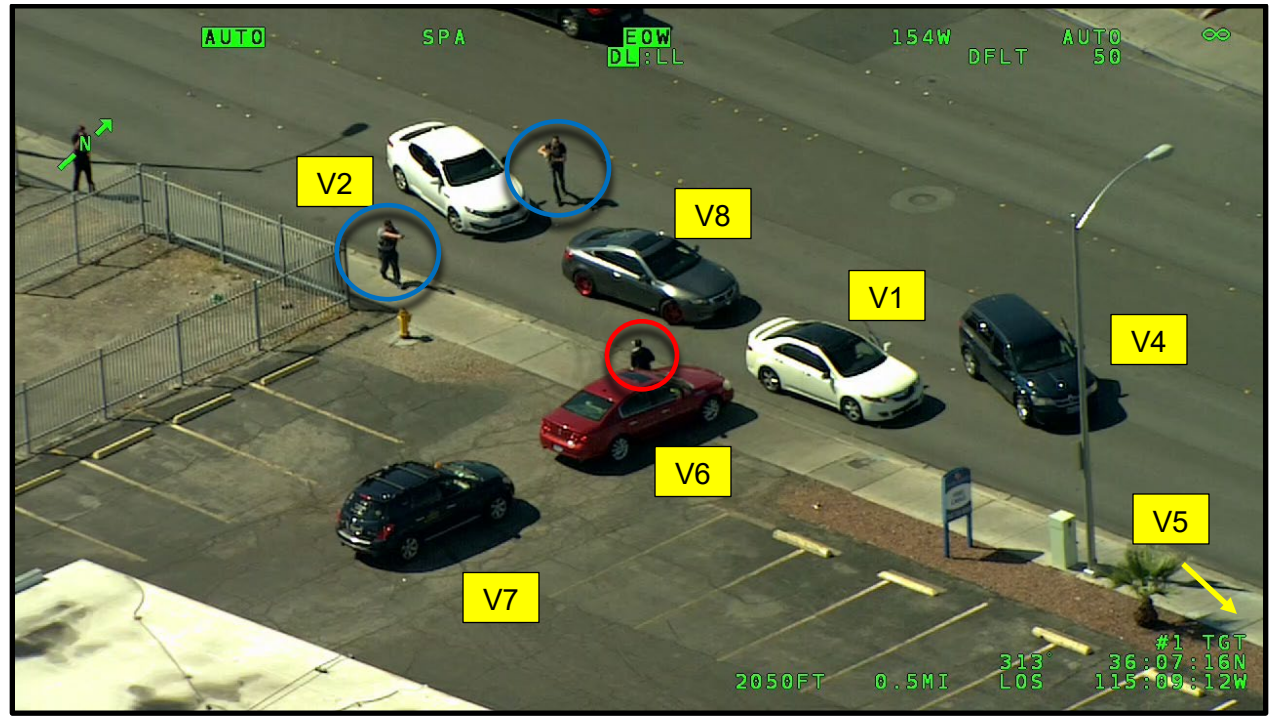
Image capture from LVMPD Air Unit AIR 5 surveillance immediately before OIS; V3 not stopped at scene yet.

Immediately before officers discharged their firearms, Decedent's white Acura TSX (V1) was stopped in an eastern direction directly in front of the Siegel Suites northwest driveway. One citizen vehicle (V8), a gray Honda Accord occupied by M.R. and J.H., was stopped in an eastbound direction directly behind Decedent's vehicle. Officer Kempf and Tomaino's unmarked LVMPD vehicle (V2), a white Kia Optima, was positioned in a southeastern direction directly behind M.R. and J.H.'s vehicle. Officer Dixon and Vasquez' unmarked LVMPD vehicle (V4), a dark blue Dodge Journey, was positioned in a southeastern direction just to the northeast of Decedent's vehicle. One citizen vehicle (V6), a red Buick Lucerne occupied by B.B., was stopped perpendicular to V1 and positioned to exit the Siegel Suites driveway. A third citizen vehicle (V7), a dark colored SUV, was stopped directly behind V6 and positioned in the same direction.