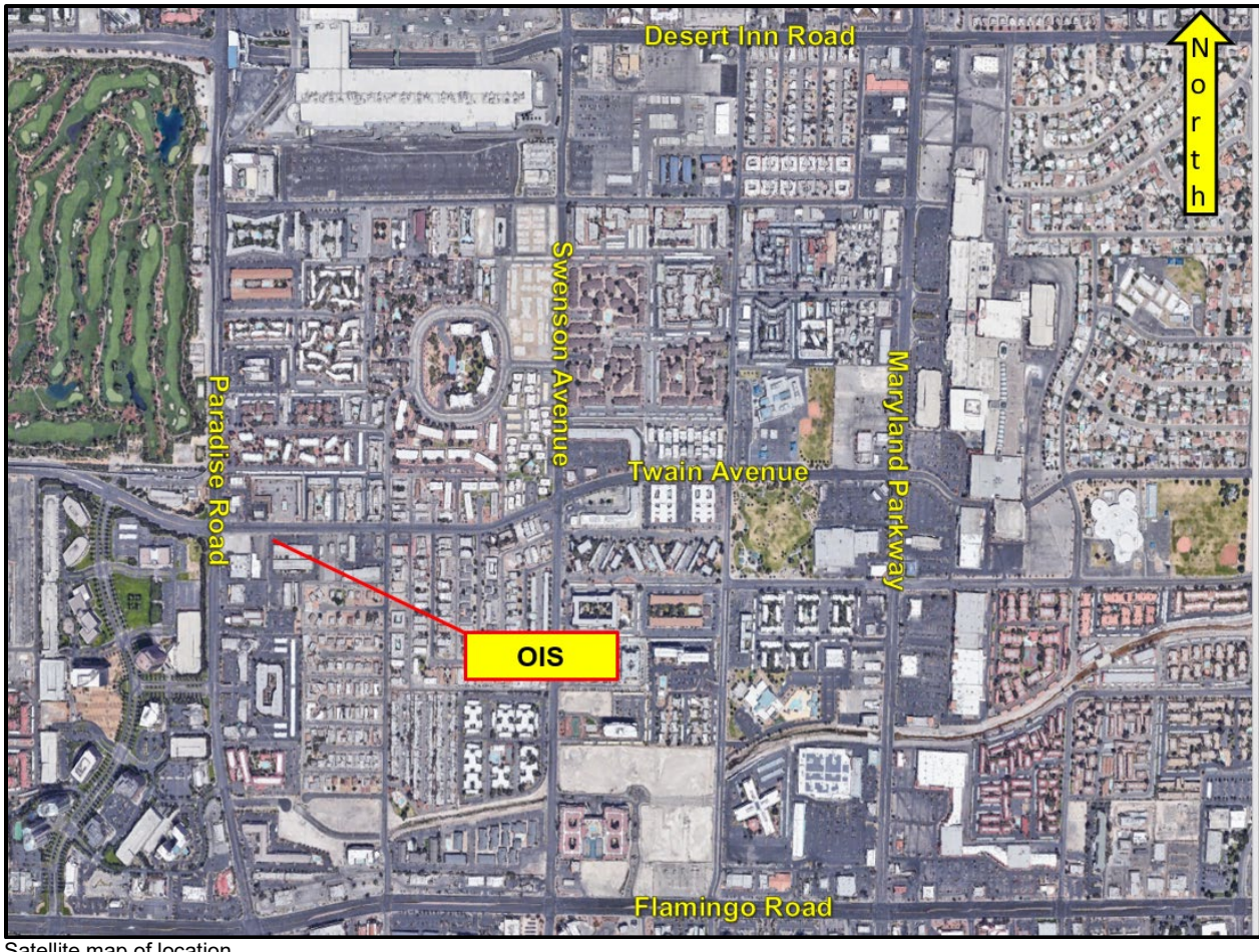
Satellite map of location.

The use of force event occurred in the far righthand lane of eastbound East Twain Avenue and in front of the northwest driveway of the Siegel Suites located at 455 East Twain Avenue, Las Vegas, Nevada, just east of Paradise Road.