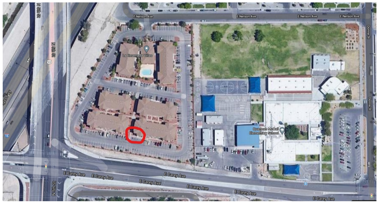
Google map of the location of the incident. Red circle shows the area around Apartment 1028

Apartment 1028, where the incident began, is located on the first floor at the southwest corner of Building D. There is a small landscaping area in front of the apartment which separates the sidewalk bordering the parking lot from the residential area.