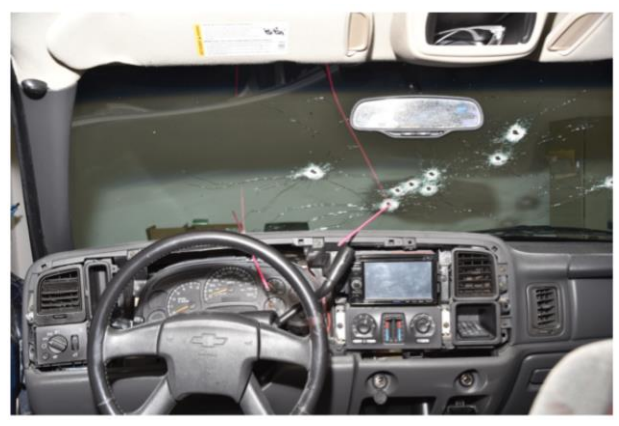
Figure 7 – Photographs of Bullet Strikes and Trajectory Rods as Viewed from Outside and Inside the Chevrolet Truck