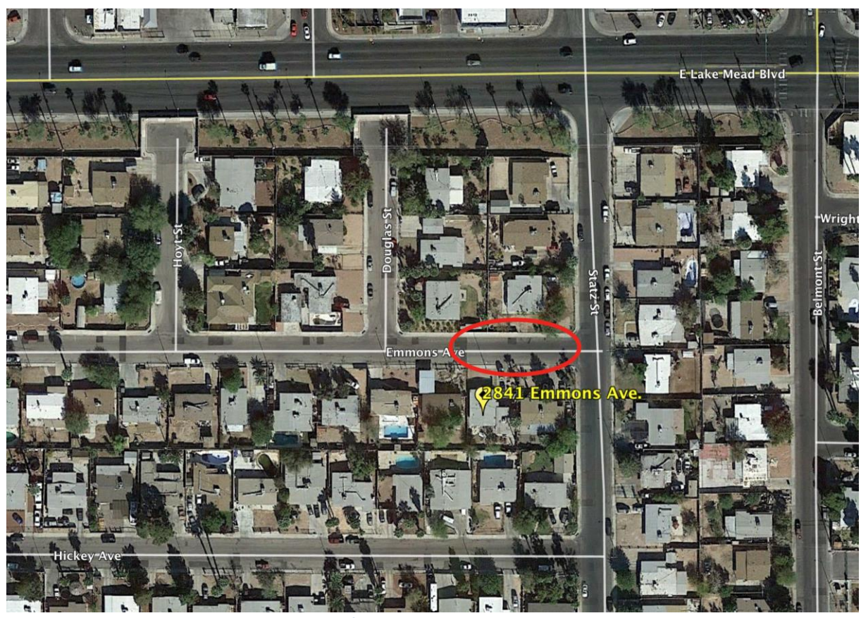
Figure 1 - Satellite Image of 2841 Emmons Avenue and Surrounding Area

The scene primarily consisted of the residence at 2841 Emmons Avenue and the street immediately north of the residence. The blue Chevrolet pickup truck that Decedent had driven was parked in the middle of street on the 2800 block of Emmons Avenue, slightly east of the residence. Decedent's body was laying in the street outside the open driver-side door of the truck. A marked patrol sport-utility vehicle ("SUV") was parked directly in front of the Chevrolet truck, facing toward it.