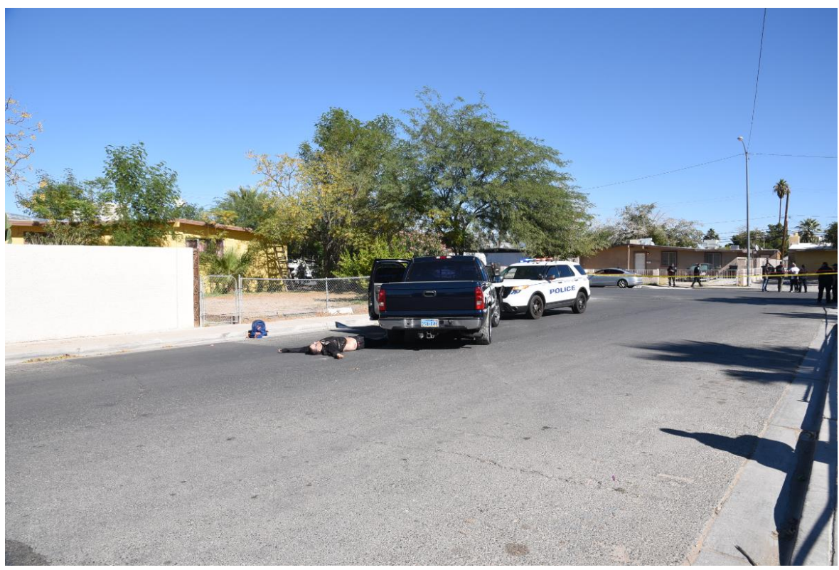
Figure 3 – Scene Photograph Depicting Location of Decedent and Stolen Chevrolet Pickup Truck

Inside the truck, there was blood on the driver seat, center armrest and steering wheel. There were ten apparent bullet holes in the front windshield of the truck. The truck appeared to have been stolen, as the bottom of the steering column and ignition housing was missing and the lock mechanism on the driver door handle was punched out, leaving a void. Later that day, at approximately 05:20 p.m., officers from the Las Vegas Metropolitan Police Department ("LVMPD") met with the registered owner of the truck, D.F., who reported that the truck was stolen earlier that day between 01:00 a.m. and 01:30 p.m. The theft was reported under LVMPD Event Number 181000167498.