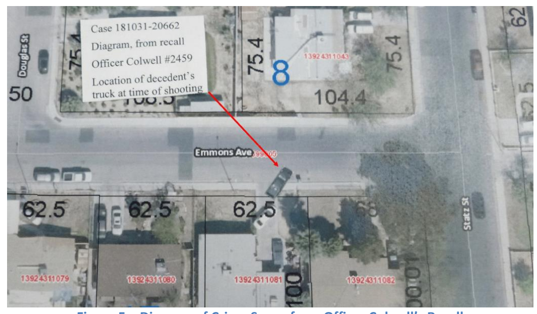
Figure 5 – Diagram of Crime Scene from Officer Colwell's Recall

During his voluntary statement, Officer Colwell was provided a map of the area and a cutout of a truck to scale. Officer Colwell pointed out where Decedent's truck started and where it came to rest. Upon his initial contact, the Chevrolet was backed up into the front yard of 2841 Emmons, facing north toward the street. The driver side tires were on or near the driveway, while most of the truck was parked in the yard to the east of the driveway. The front of the truck was not obstructing the sidewalk. At the time of the shooting, the truck was pulled forward from the driveway. The front of the truck was in the street, while the back of the truck was on the sidewalk. The truck was angled facing northeast. The final location of the truck, based on his recollection, was slightly forward of where the shooting occurred, in the middle of Emmons Avenue, east of the driveway of 2841 Emmons.