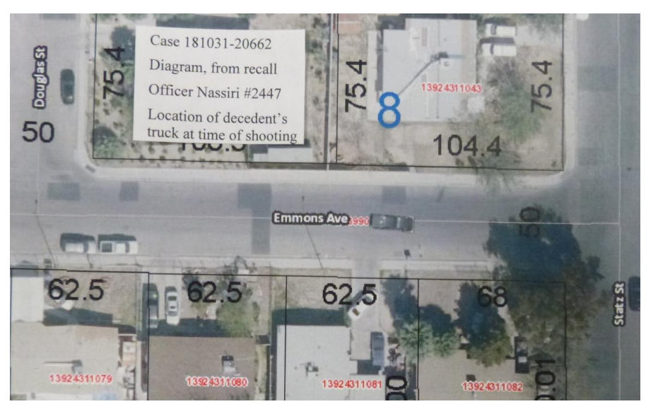
Figure 6 – Diagram of Crime Scene from Officer Nassiri's Recall

During his voluntary statement, Officer Nassiri was provided a map of the area and a cutout of a truck to scale. Officer Nassiri pointed out where Decedent's truck started and where it came to a stop. Upon his initial contact, the Chevrolet was parked in the driveway of 2841 Emmons, facing north. The front of the truck was past the edge of the driveway into the sidewalk. At the time of the shooting, the truck was in the middle of Emmons Avenue, east of the driveway at 2841, facing due east. He pointed out where the truck's final location was after it rolled forward without a driver, which was accurate when compared to photos from the scene.