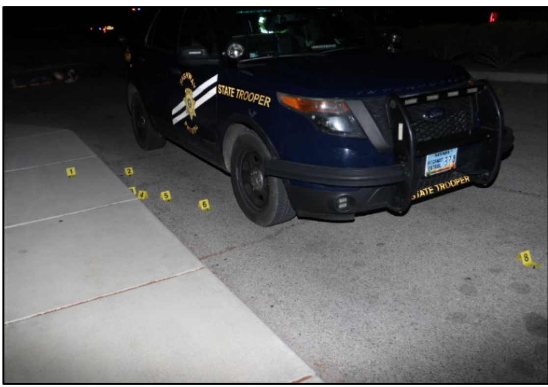
Trooper Dobbins' cartridge casings.