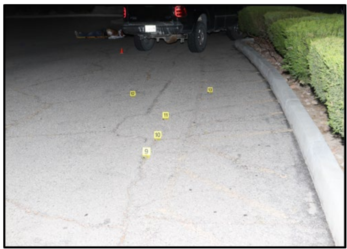
Trooper Ramm's cartridge casings.