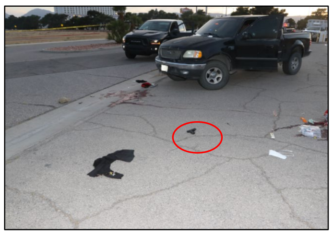
Scene photograph showing Decedent's firearm.