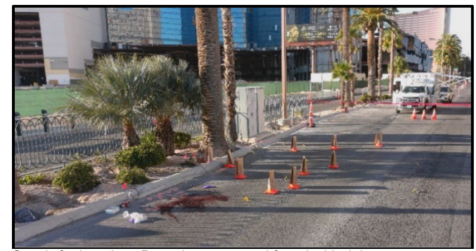
South-facing view; Decedent emerged from behind the power box and through the trees/brush as second group of shots were fired