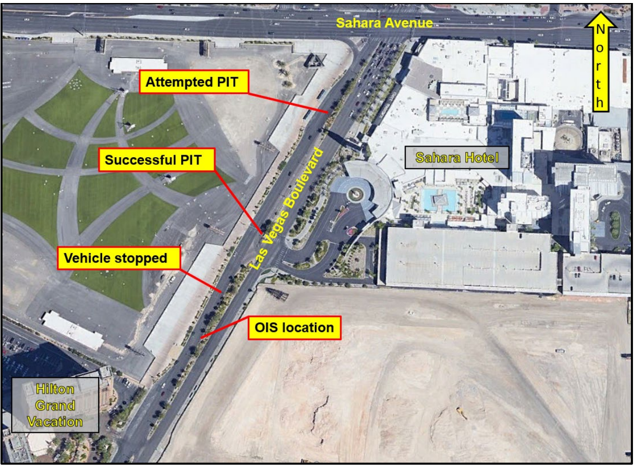
Satellite map of location.

The use of force event occurred in the southbound lanes of Las Vegas Boulevard near the center median south of Sahara Avenue, south of the Sahara Las Vegas and north of Hilton Grand Vacations.