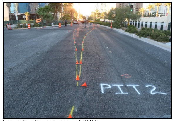
Impact location for successful PIT.