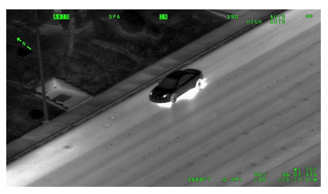
Sparks from damaged wheels after successful Stop Stick deployment on Desert Inn Road.