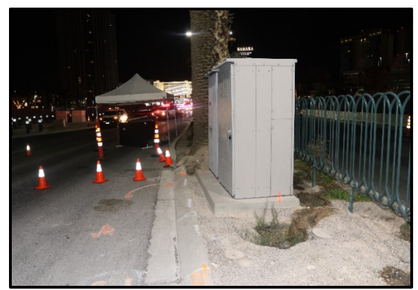
North-facing view; Decedent abruptly charged north/northeast toward officers, then moved behind the power box as first shots were fired.