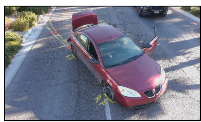
Decedent's Pontiac G6 after successful PIT.