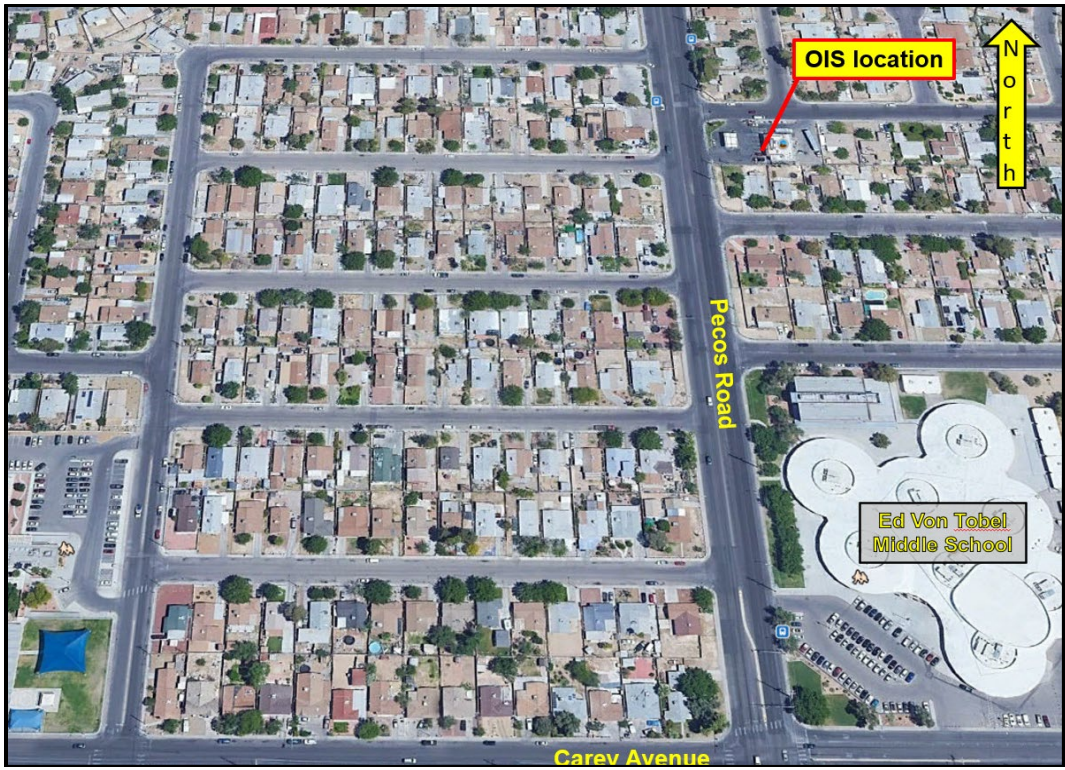
Aerial of the OIS location