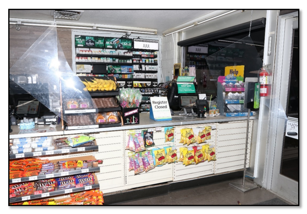
Inside the 7-Eleven located at 2577 N. Pecos Road