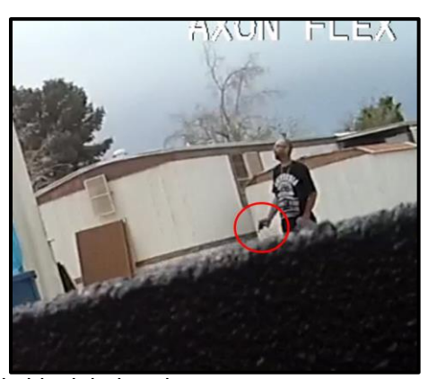
Left: BWC screenshot showing Decedent holding the gun in his right hand. Right: BWC screenshot from a different angle showing Decedent with the gun in his right hand.