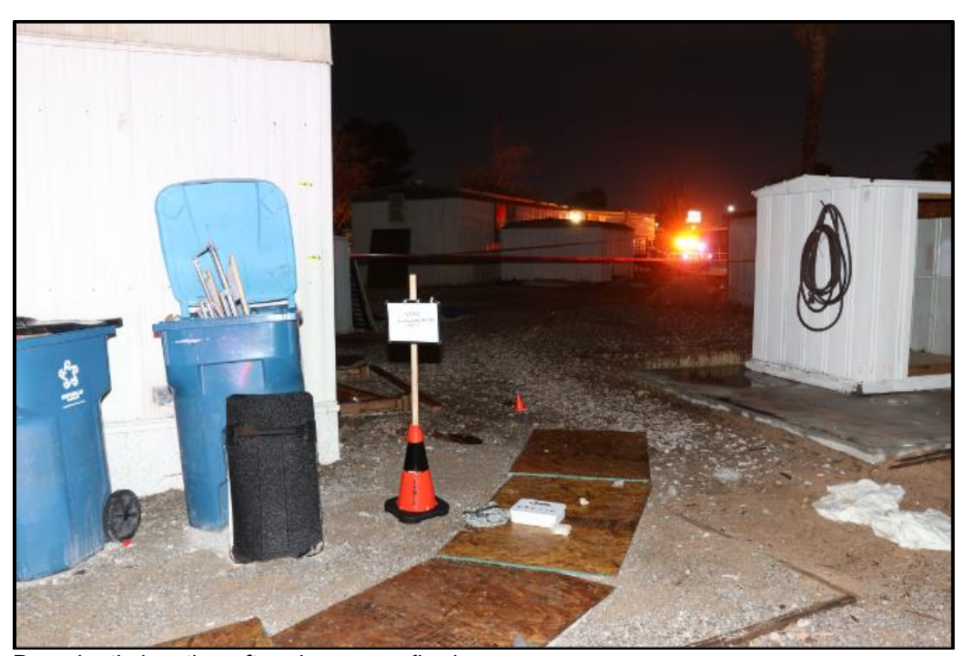
Decedent's location after shots were fired.