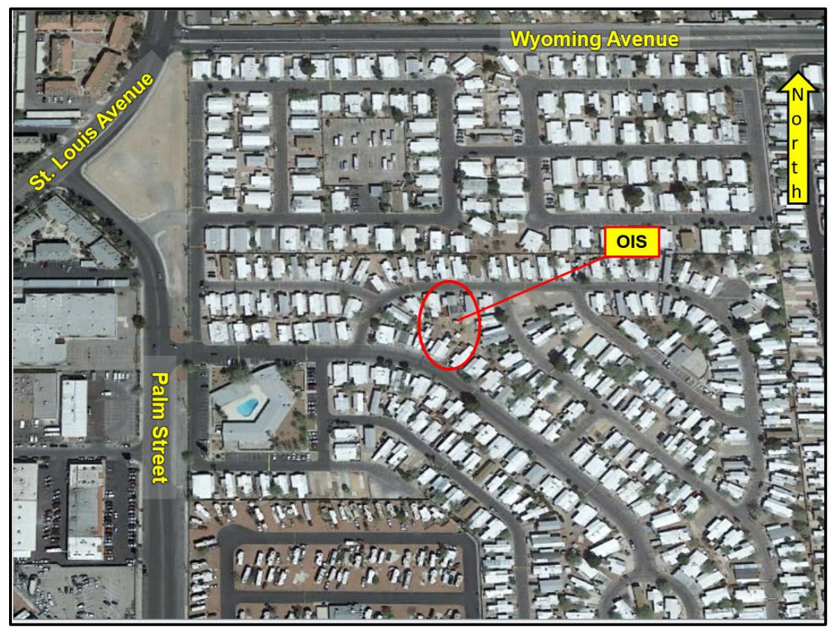
Aerial overview of the OIS location.

The scene was located in the Riviera Mobile Home Park, located at 2038 Palm Street, Las Vegas, Nevada. The subject mobile home, unit #277, was in the middle of the mobile home park and was surrounded by other residential trailers.