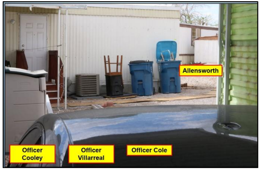
Officers' locations at the time officers fired.