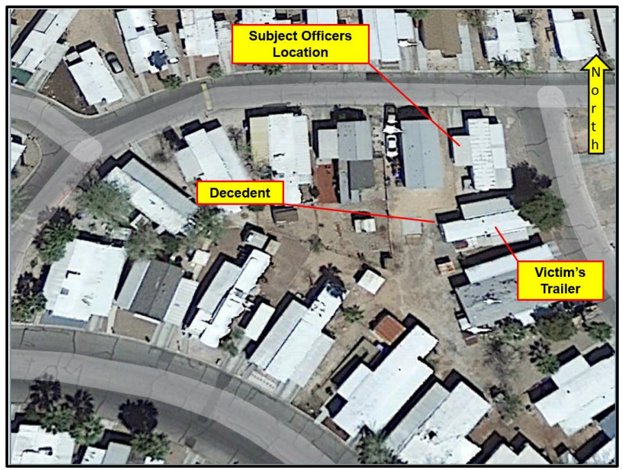
Close-up aerial view of the OIS location.