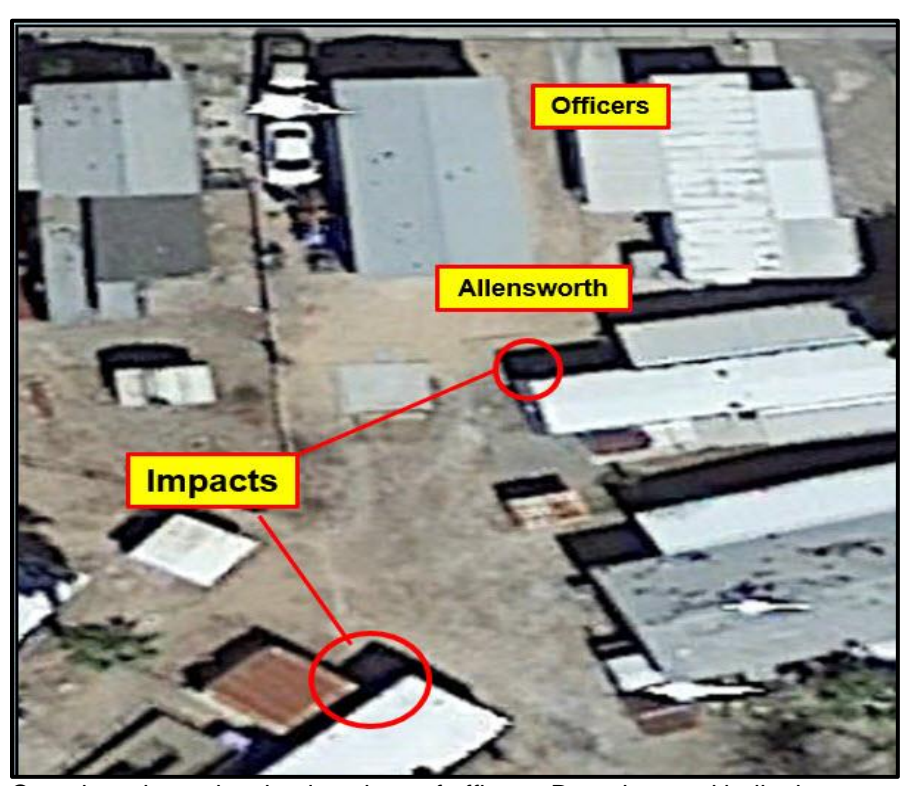
Overview photo showing locations of officers, Decedent and bullet impacts.