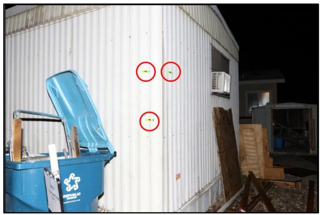
Impact locations of officers' shots.