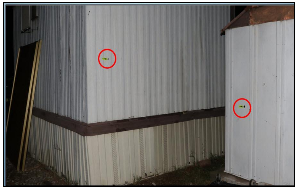
Additional locations of officers' shots.