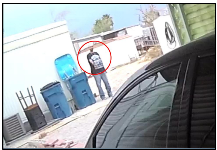
BWC screenshot showing Decedent raising his firearm.