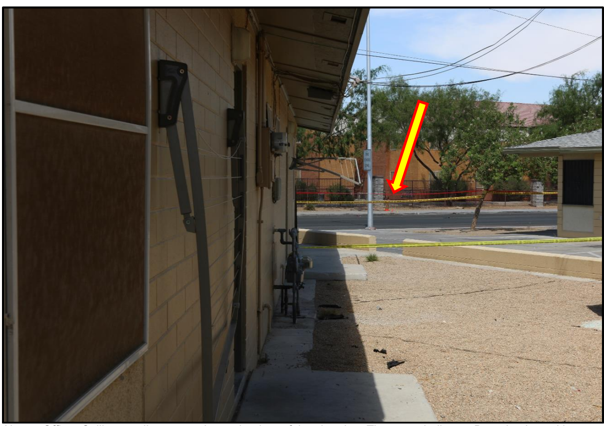
Above: Officer Collingwood's perspective at the time of the shooting. The arrow indicates Decedent's position.