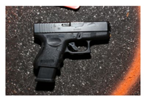
(Item 7: Glock 19 Gen 4 semiautomatic handgun)

Decedent was transported to Sunrise Hospital where he ultimately was pronounced dead. An autopsy revealed that Decedent had two gunshot wounds: One to the right lateral aspect of his chest from an indeterminate distance, and a contact gunshot wound to the right temple. Because the gunshot wound to the side of the chest was survivable, the cause of death was the self-inflicted gunshot wound to the head, and the manner of death was determined to be a suicide.