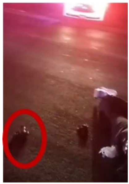
(BWC depicting a firearm next to Decedent)