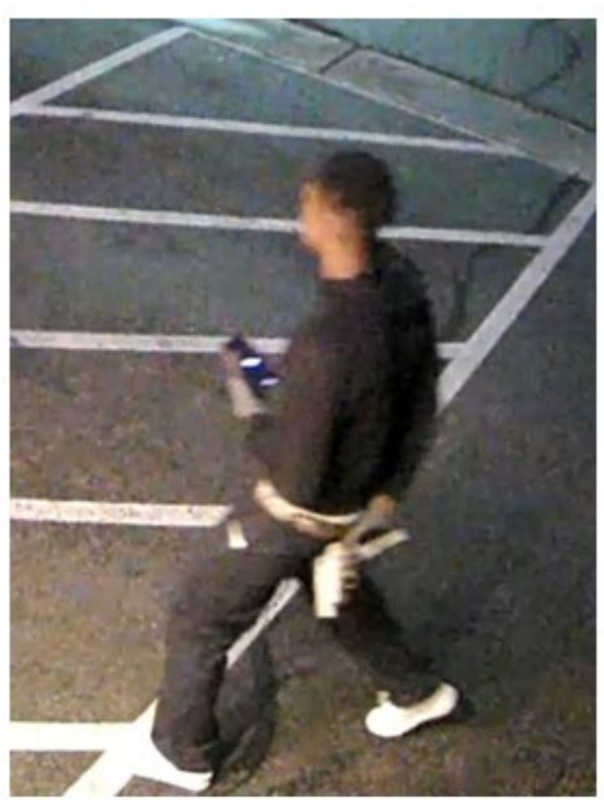
(Decedent walking past PKWY Tavern)