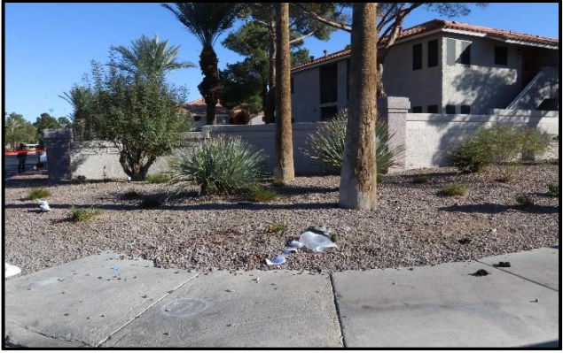
Above left: Overall picture of the scene. Above right: Location where Decedent was taken into custody.