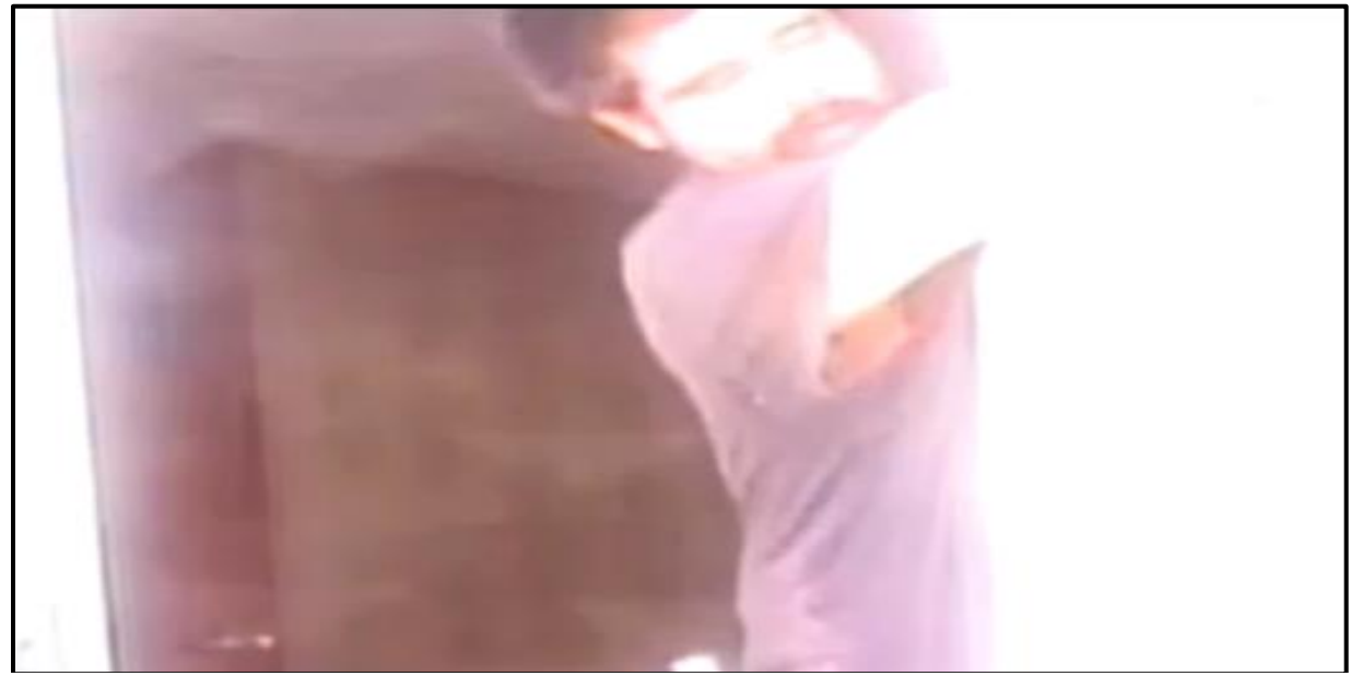
Above: Decedent's pointing his firearm at the Red BearCat and stationed officers just prior to the OIS.