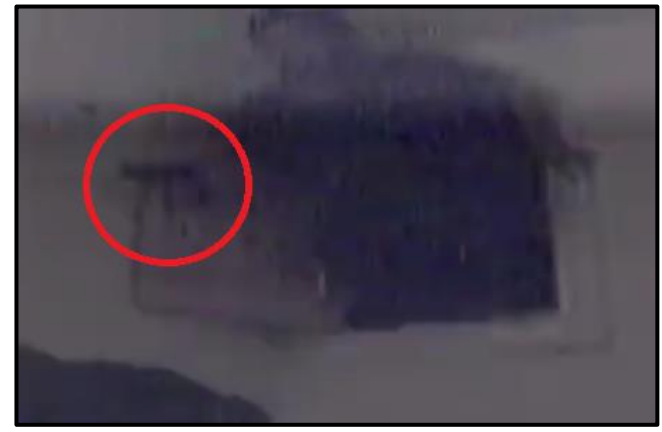
Above left: Muzzle flash from Decedent's firearm as he hid in the attic crawl space. Above right: Decedent exiting the crawl space armed with his firearm.