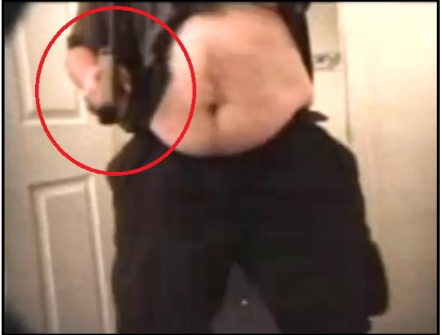
Above left: Decedent pointing his firearm at the Small Robot from within the building. Above right: Close-up image of Decedent's firearm.