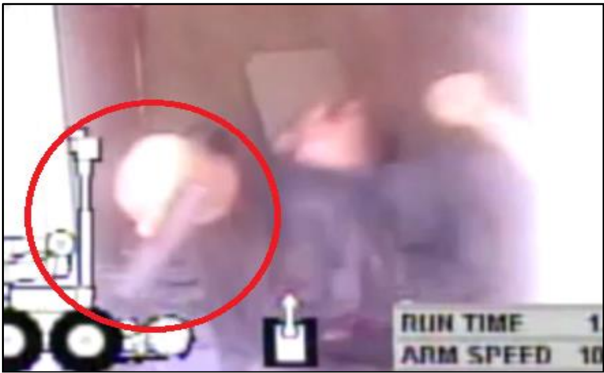
Above: Decedent holding his firearm as he fell after being struck during the OIS.