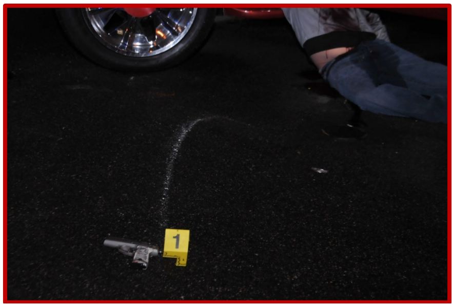
Decedent's 9mm Sturm Ruger semi-automatic handgun.