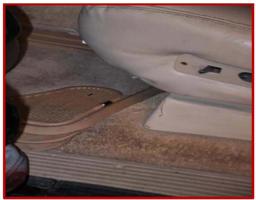
Spent 9mm cartridge case from Officer's Cooley's weapon found on the floor board of Decedent's Escalade.

on the sidewalk pointing south from the Circle K. A white Mercury Sable was parked north of the gas pumps, next to a patrol vehicle. A maroon Cadillac Escalade was parked by the gas pumps, with both the driver and passenger doors open. Decedent was sitting on the ground, leaning against, and partially inside, the Escalade's open driver's side door. There were three 9mm spent cartridge cases, one projectile and a baseball cap on the driver's side floorboard.