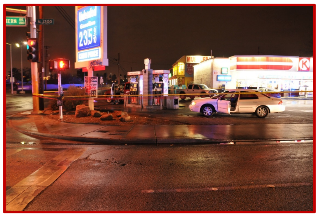
1301 N. Eastern, Las Vegas, Nevada

Upon exiting the parking lot, the white sedan failed to turn into the #1 traffic lane; instead, it turned into the #3 traffic lane. Based upon that infraction, Officers McGee and Cooley initiated a traffic stop on the sedan. The stop occurred in front of the Circle K convenience store located at 1301 North Eastern, North Las Vegas, Nevada. Once stopped, officers saw that the maroon SUV was parked at the Circle K gas pumps, located approximately 10-15 feet from the white sedan.