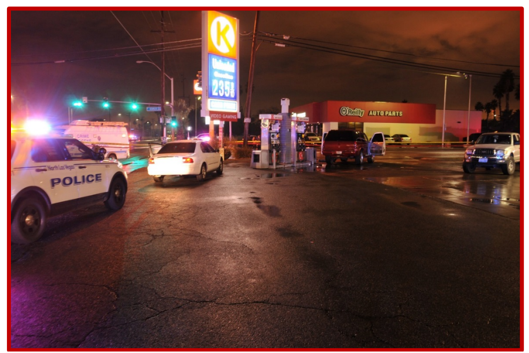
1301 N. Eastern, Las Vegas, Nevada