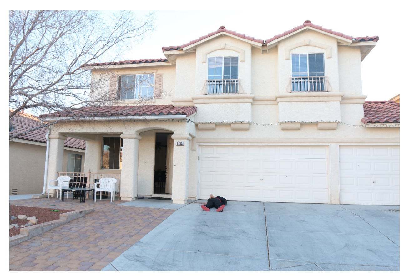
The scene in front of the house at 8335 Gilded Crown Court.