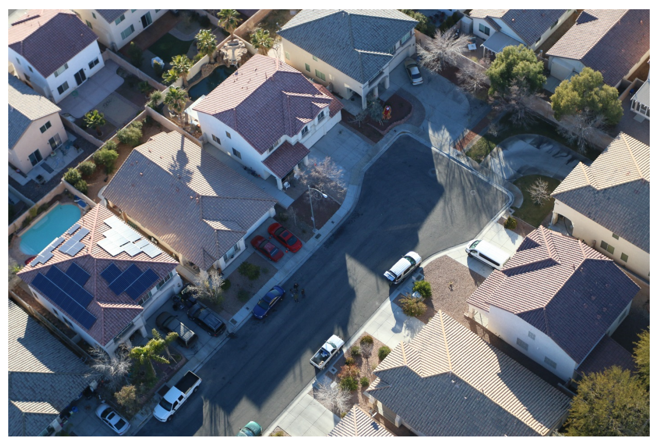
Cul-de-sac on Gilded Crown Court. The incident occurred in the drive way of 8335 Gilded Crown Court.

At approximately 2:20 pm, Officer Horsley, the observer in the Air Unit, observed Decedent jump over walls into backyards along Palace Heights Avenue. Officer Horsley observed Decedent go south and jump the wall into a backyard, run along the side of a house, and exit onto Gilded Crown Court.