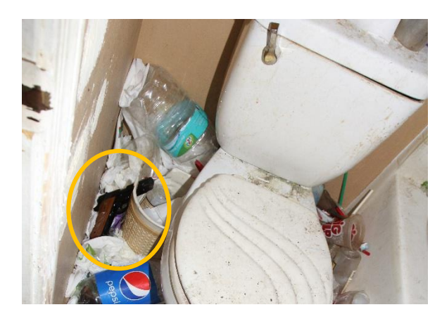
(Smith & Wesson 9mm semiautomatic handgun located on side of toilet in master bathroom)

The bathroom was located in the northwest corner of the room, north of the west vanity and sink area. A Smith & Wesson model 39-2 9mm semiautomatic handgun, was located on the south side of the toilet, on its left side, pointing north and upward. The firearm was not cocked, the safety was off, the chamber was empty, and the magazine contained eight (8) cartridges.