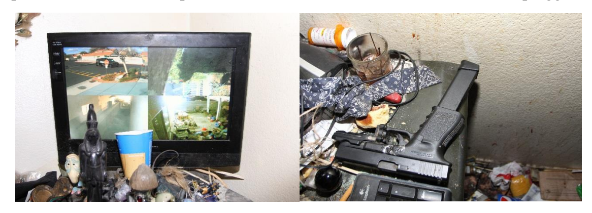
(Surveillance Monitor and Glock 19 with a thirty-one (31) round magazine found in master bedroom)

the key board was a Glock 19, 9mm semiautomatic handgun, serial# NZH098, with an extended thirty-one (31) round magazine in the well. The gun was resting on its left side pointing west, and had a rail below the barrel. The gun had a cartridge in the chamber and twenty-nine (29) cartridges in the magazine. Also on the desk next to the keyboard was a cell phone, and another cell phone was on the floor next to the desk and was plugged in.