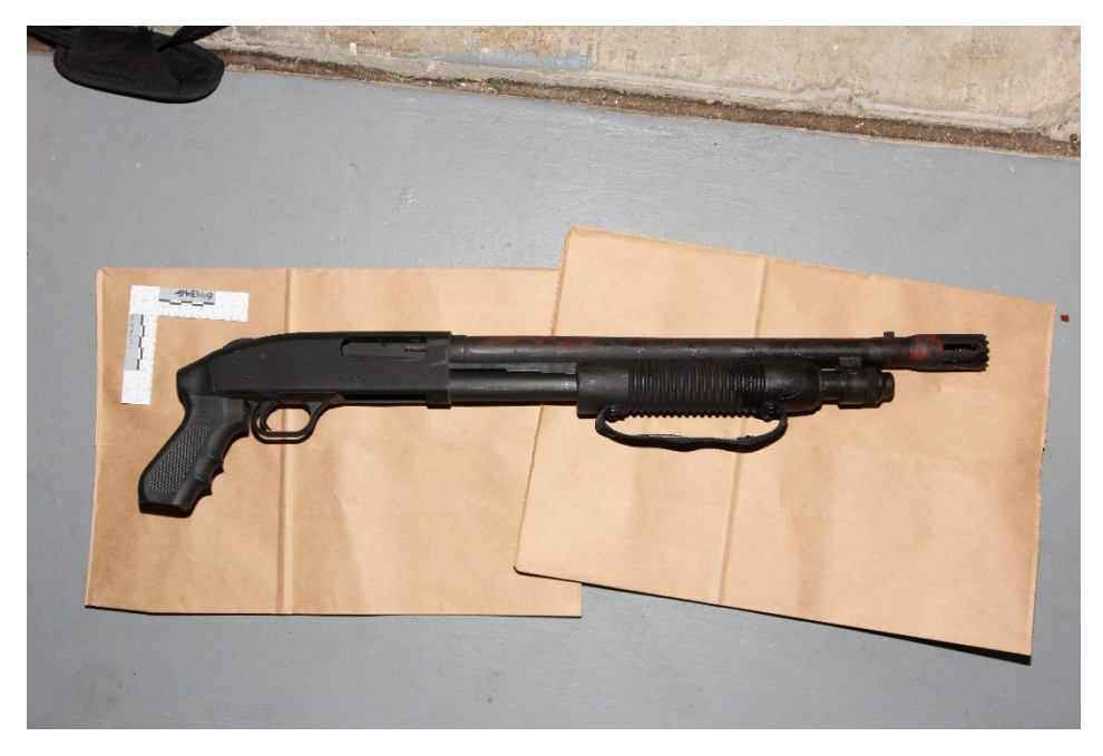
(Shotgun with which Decedent was armed)

A Mossberg 500 pistol grip, pump action, 12 gauge shotgun, serial# T643431, was located in the pooled blood on the floor of the entry way. The shotgun was resting on its left side pointing west. When later examined, it was determined that there was one (1) shot shell cartridge in the chamber, and four (4) additional cartridges were in the magazine tube.