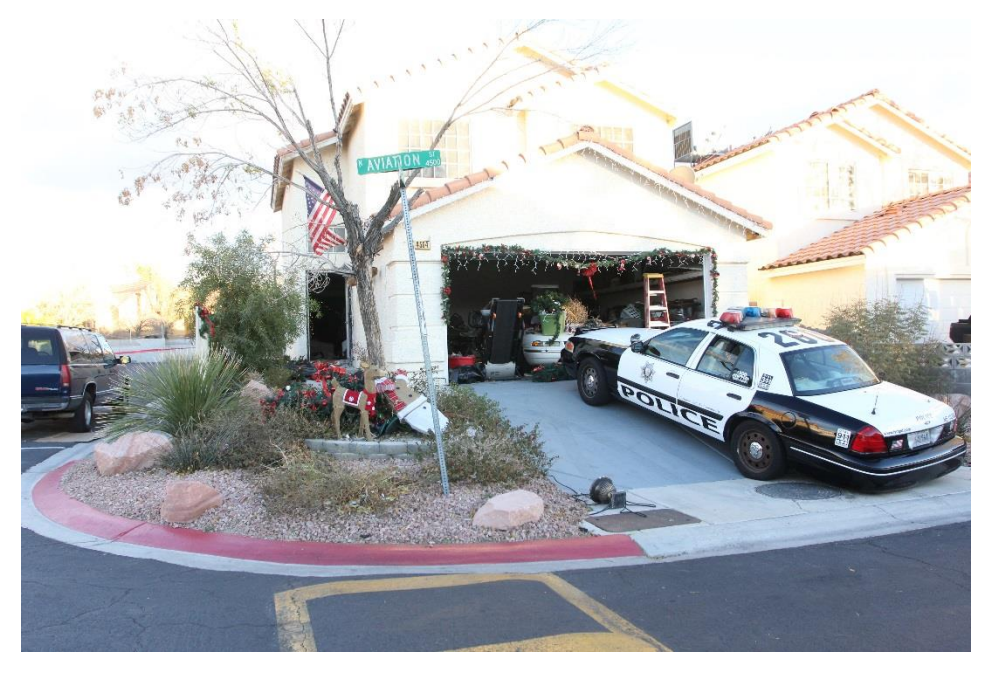
(Front of Decedent's Home on Aviation Street)

The address of 4564 Aviation Street was a two-story single family residence with a two car garage. It was located on the southeast corner of Aviation Street and Pentagon Avenue. The garage was on the southwest corner of the residence. The front door of the residence was located on the north side of the residence and faced west.