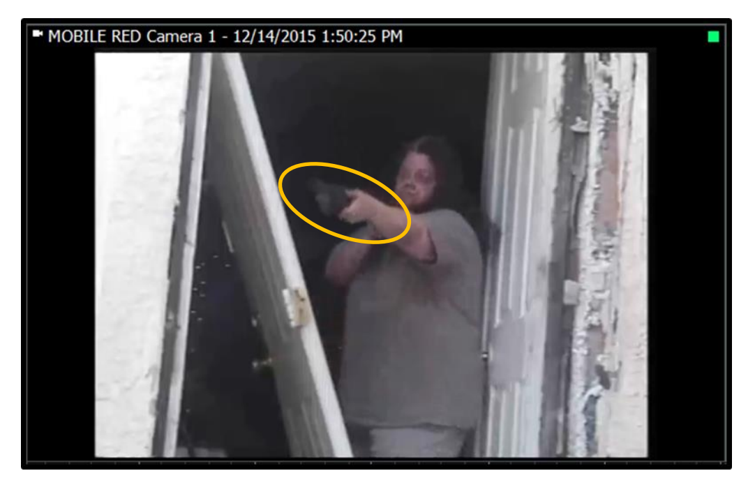
(Still photograph taken from robot video showing Decedent aiming the shotgun in the direction of officers and other homes.)