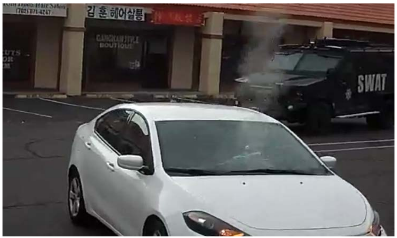
Still from video surveillance taken from Bearcat #9456 showing Decedent's first gunshot at the SWAT vehicle and smoke associated with the gunshot

There was also video recovered from the rear approaching Bearcat, the ARMOR robot which was activated after shots were fired and a cell phone recovered from civilian witness J.E. who took the video from across the street.