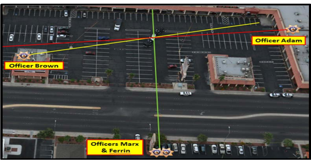
Position of officers who fired their weapon with trajectory