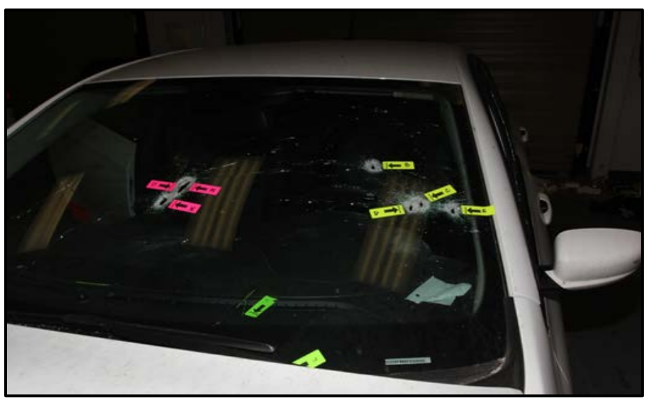
Photograph of Decedent's vehicle with CSA stickers. Pink arrows show where Decedent fired her weapon

Handwritten notes were on the ground on the south side of the vehicle adjacent to the left rear tire. A plastic baggie containing an unknown white substance was on the ground near the right side of the vehicle. A bullet was located underneath the vehicle. A Jimenez Arms J.A. Nine 9mm semiautomatic handgun, serial number 135830, with apparent blood stains was located on the pavement on the north side of the vehicle. The handgun was found to contain a cartridge inside the chamber and a magazine containing four (4) cartridges. A bullet fragment was located on the pavement in the parking lot between vehicle #1 and the south edge of the shopping center.