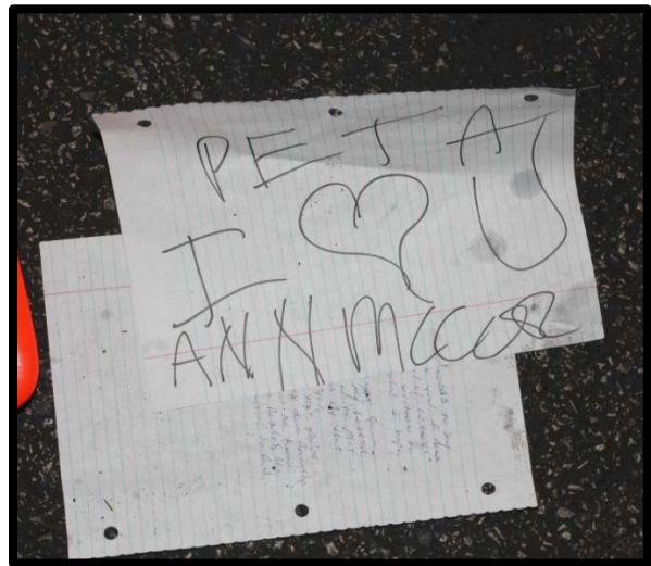
Note found on the ground by Decedent's vehicle

Handwritten notes were on the ground on the south side of the vehicle adjacent to the left rear tire. A plastic baggie containing an unknown white substance was on the ground near the right side of the vehicle. A bullet was located underneath the vehicle. A Jimenez Arms J.A. Nine 9mm semiautomatic handgun, serial number 135830, with apparent blood stains was located on the pavement on the north side of the vehicle. The handgun was found to contain a cartridge inside the chamber and a magazine containing four (4) cartridges. A bullet fragment was located on the pavement in the parking lot between vehicle #1 and the south edge of the shopping center.