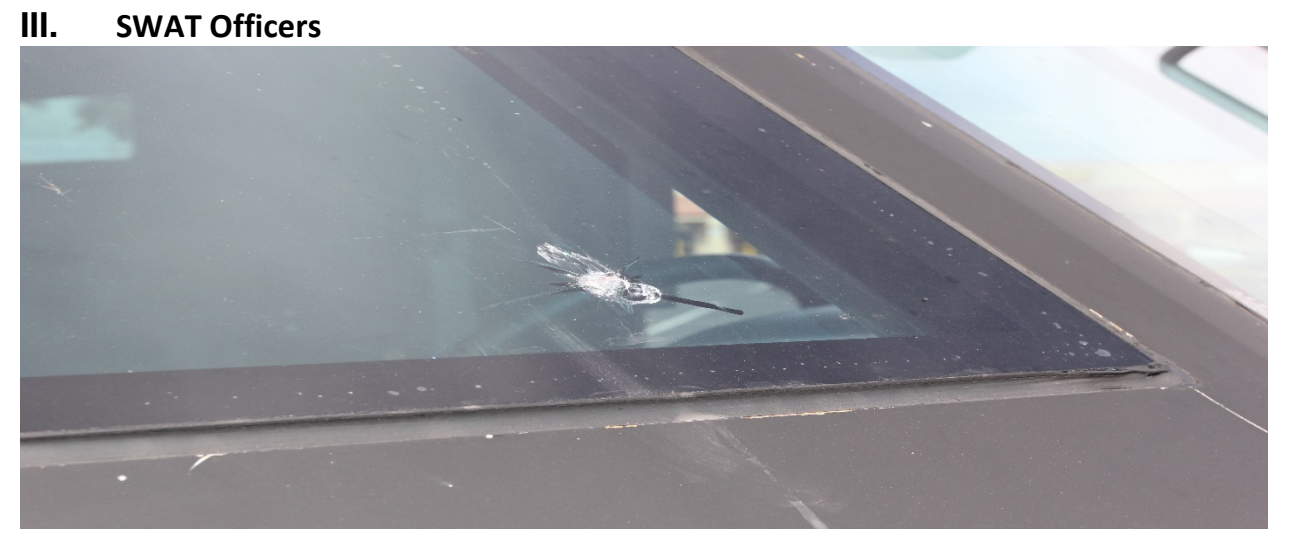
Gunshot defect to the passenger side of the front approaching Bearcat's windshield