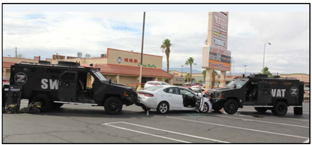
Final position of the three vehicles