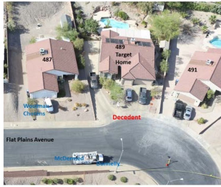
Overview photo showing the Target Home, neighboring houses, and the Cox truck. Photo also indicates the approximate location of HPD officers and Decedent at time of shooting.

The following sections detail the events and actions of each officer responding to the Target Home. The Clark County District Attorney's Office (CCDA) has reviewed all police reports, statements, and crime scene analyst (CSA) reports submitted by the HPD. The CCDA has also listened to all 911 calls and officers' radio traffic. This section highlights the statements of the pertinent officers involved in the use of force, resulting in Decedent's death.