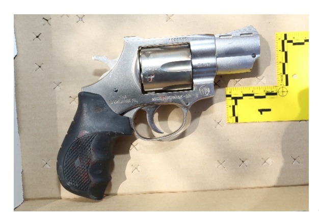
Decedent's HWM Model EA/R .38 Special and .357 Magnum Windicator Revolver.

Decedent was armed with a HWM Model EA/R Windicator (.38 Special and .357 Magnum) Serial No. 1094418 revolver. After the shooting, Las Vegas Metropolitan Police Department Forensic Scientist Jonathan Fried examined Decedent's weapon, including the cases and cartridges inside the gun's cylinder. Fried opined that all four cases in the cylinder were fired by Decedent's HWM revolver. Fried also opined that a copper bullet jacket found scattered among the bullet fragments by the Cox truck had the same rifling characteristics as the test fired rounds from the HWM revolver. Insufficient detail existed on this