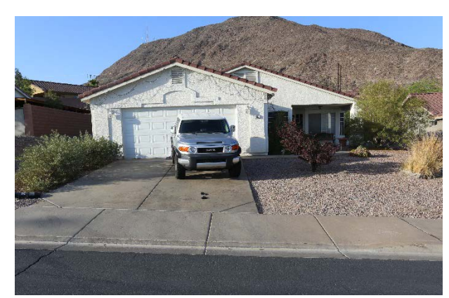
House located at 487 Flat Plains Avenue. This house is located east of the Target Home.

CSAs documented blood drag marks located on the street northeast of 487 Flat Plains Avenue. These marks were created after the shooting, when HPD officers moved Decedent's body away from the front of the Target Home.