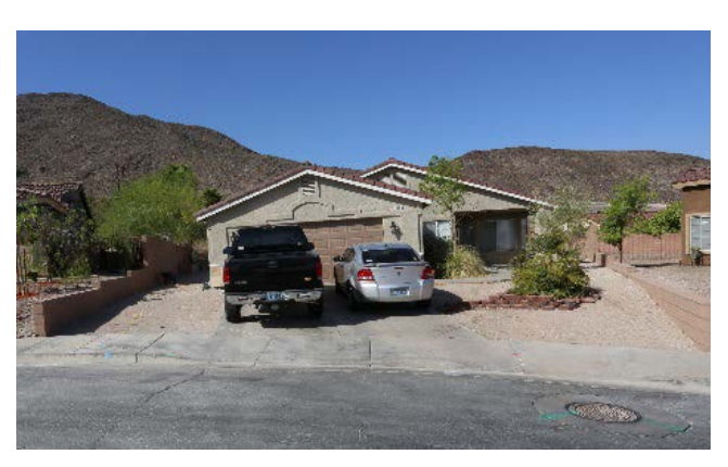
House located at 491 Flat Plains Avenue. This house is west of the Target Home.

The house located at 491 Flat Plains Avenue is the neighboring property to the west of the Target Home. It is positioned on the south-side of the cul-de-sac. The front of the house is angled towards the northeast. The house had a two-car garage in the northeast corner of the house. Two bullet holes were visible into the garage door. A black 2000 Ford F-250 was parked in the driveway, head-in. A bullet hole was observed in the front left quarter panel, adjacent to the driver's door.