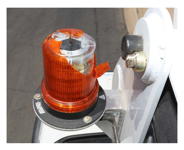
Cox truck's safety light indicating a bullet impact strike at time of shooting.

CSAs documented visible firearms evidence at and around the Cox truck. CSAs located 10 "Winchester .223 REM" cartridge cases on the sidewalk on the north side of the truck. They located 10 "Winchester .223 REM" cartridge cases northwest from the front right corner of the Cox truck. Six bullet fragments were documented by the front of the truck where Officer Donnelly was positioned. Two bullet strikes were documented on the asphalt street surface by the front of the truck. Near the location where Officer McDermed was positioned, a bullet fragment was located by the truck's right rear corner and another fragment was found just east