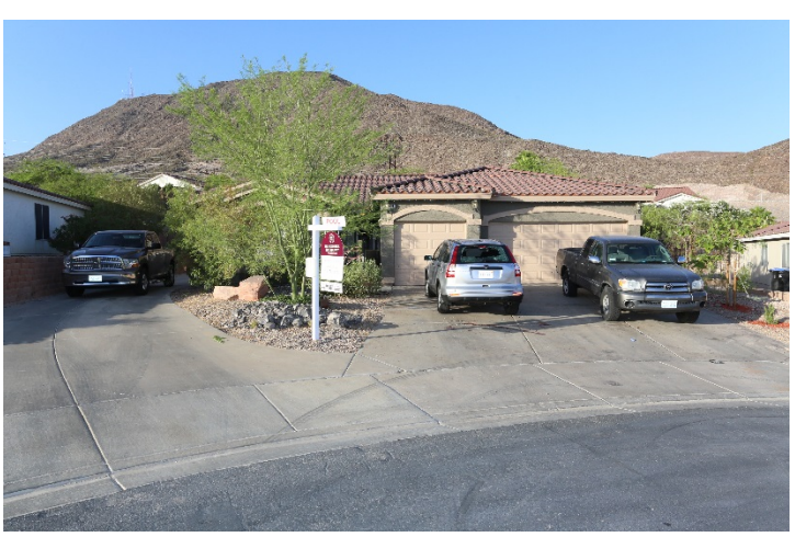
Target Home located at 489 Flat Plains Avenue.

There were two cars parked in the driveway. A 2010 Honda CRV was parked head-in on the east portion of the driveway. A 2006 Toyota Tundra pick-up truck was parked backed-in west of the Honda CRV. Several bullet holes, impacts, and strikes to the Honda and Toyota truck were observed. The garage door to the Target Home also had several bullet holes and impact marks. A secondary driveway is located on the eastern edge of the