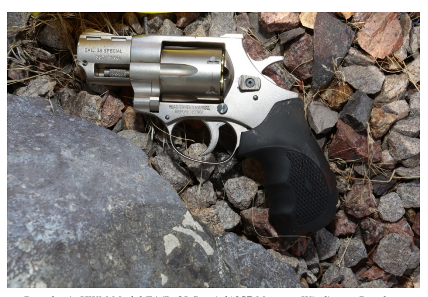
Decedent's HWM Model EA/R .38 Special/.357 Magnum Windicator Revolver.

Driveway, Front Yard, and Interior of 489 Flat Plains Avenue (Location of Decedent at Time of Shooting)