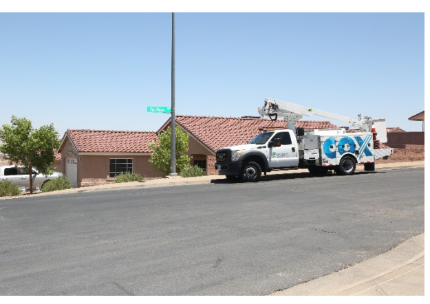
Decedent's vantage viewpoint looking at Cox truck from the end of the driveway of the Target Home at the time of the shooting.

Adjacent to the secondary driveway, crime scene analysts located nine expended cartridge cases. Five of these cartridge cases were marked "GFL .357 Magnum" and located on the ground at the base of the driveway. A "Winchester .45 Auto" cartridge case was located in the decorative rock landscape at the top of the retention wall east of and adjacent to the base of the driveway. Finally, three "GFL .357 Magnum" cartridge cases were located on the ground to the rear of the parked Dodge Ram truck. Apparent blood was observed on some of these expended cartridge cases.