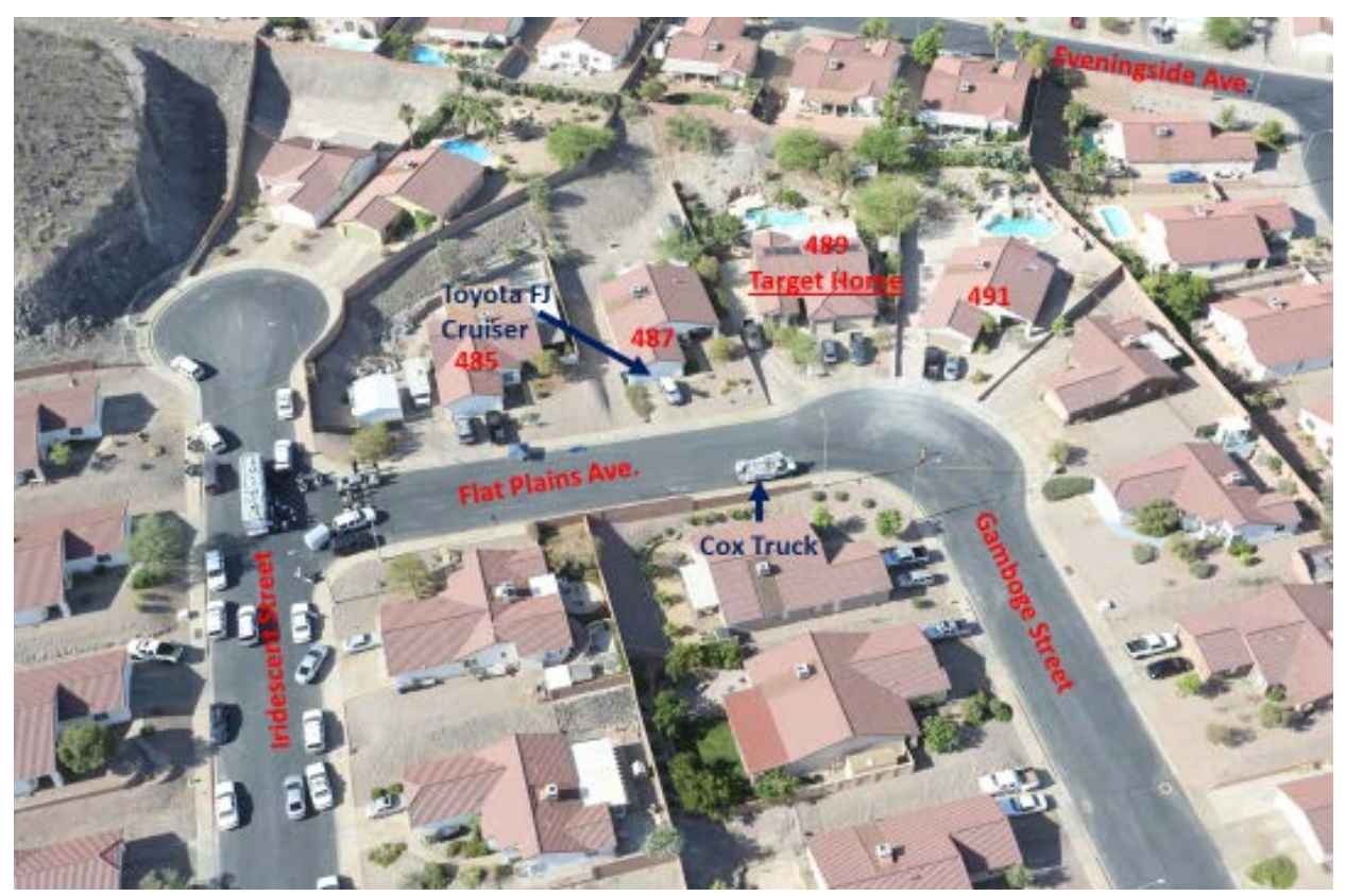
Neighborhood overview surrounding Flat Plains Avenue.