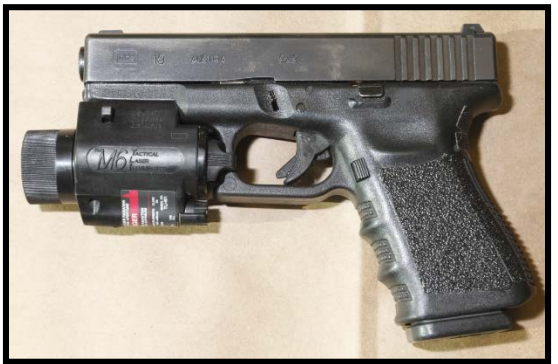
Detective Beck's Primary Handgun: Glock 19, 9 mm Luger

In regards to Detective Beck's primary handgun, the magazine from the weapon had a 15 cartridge capacity, the countdown showed one cartridge in the chamber and 14 remaining cartridges.