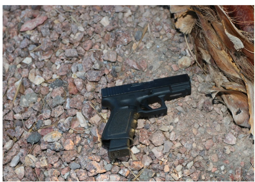
Decedent's Glock 23 .40 caliber

The gun's serial number was GSV871, and a records check revealed that it had been stolen on July 28, 2017, from the owner who had parked his vehicle at the Red Rock Casino.