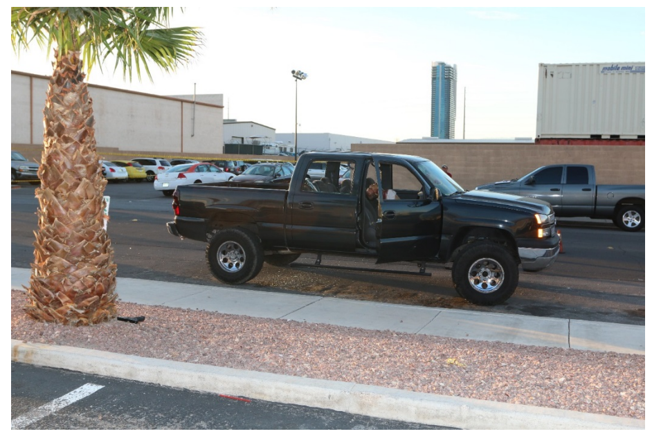
Decedent inside of the truck after the shooting and after his weapon had been removed

The gun's serial number was GSV871, and a records check revealed that it had been stolen on July 28, 2017, from the owner who had parked his vehicle at the Red Rock Casino.