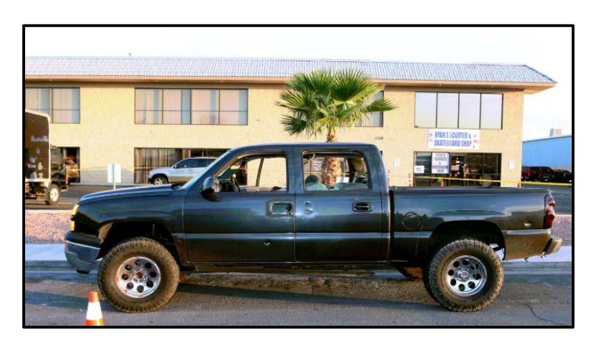
Truck as it was parked in front of 4205 West Tompkins

On August 1, 2017, P. L. activated a "find my I-Phone" application in an effort to locate his stolen property. The application indicated that the stolen I-Phone was located near the 4200 block of West Tompkins in Las Vegas. P. L. drove to that location and noticed a black, 2005 Chevrolet Silverado pick-up truck parked on the south side of Tompkins in front of a series of businesses located at 4205 West Tompkins.