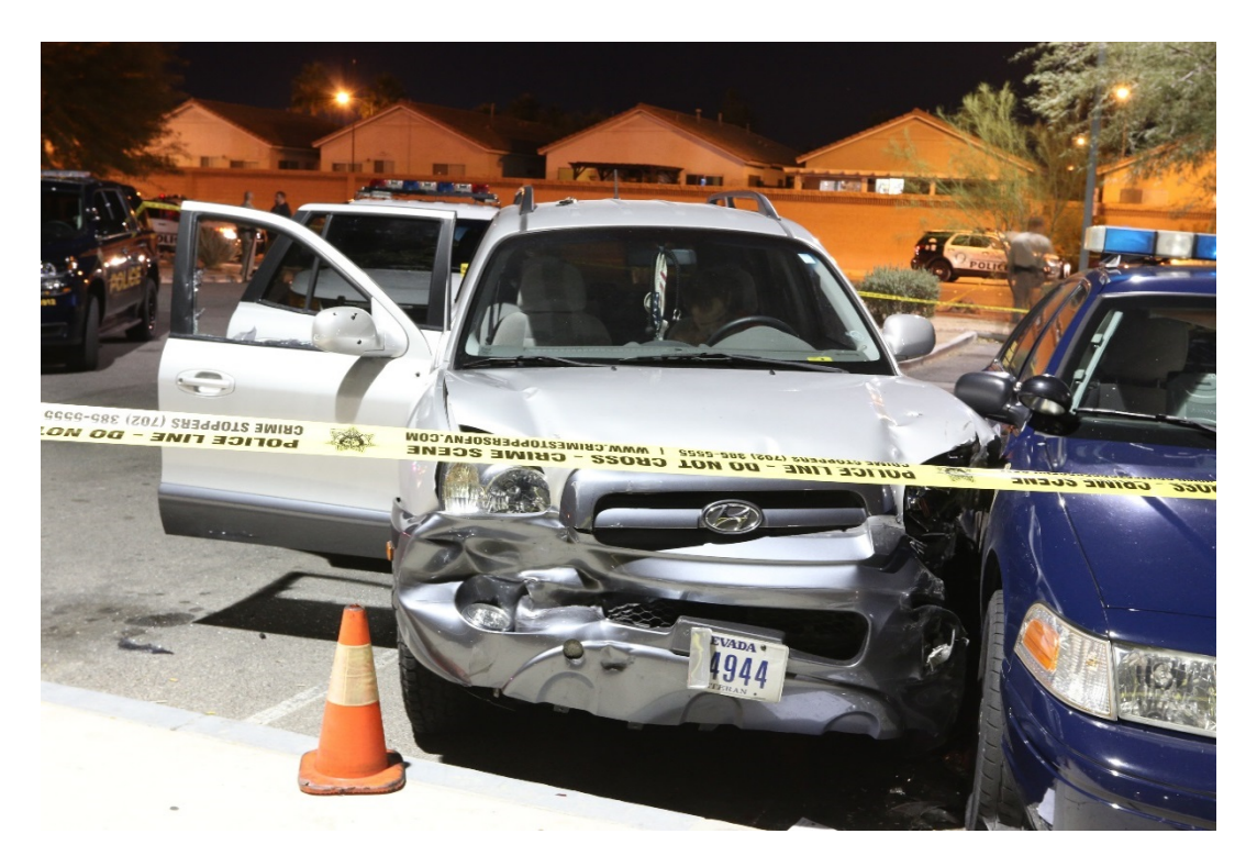
DECEDENT'S VEHICLE AND CCSDPD VEHICLE