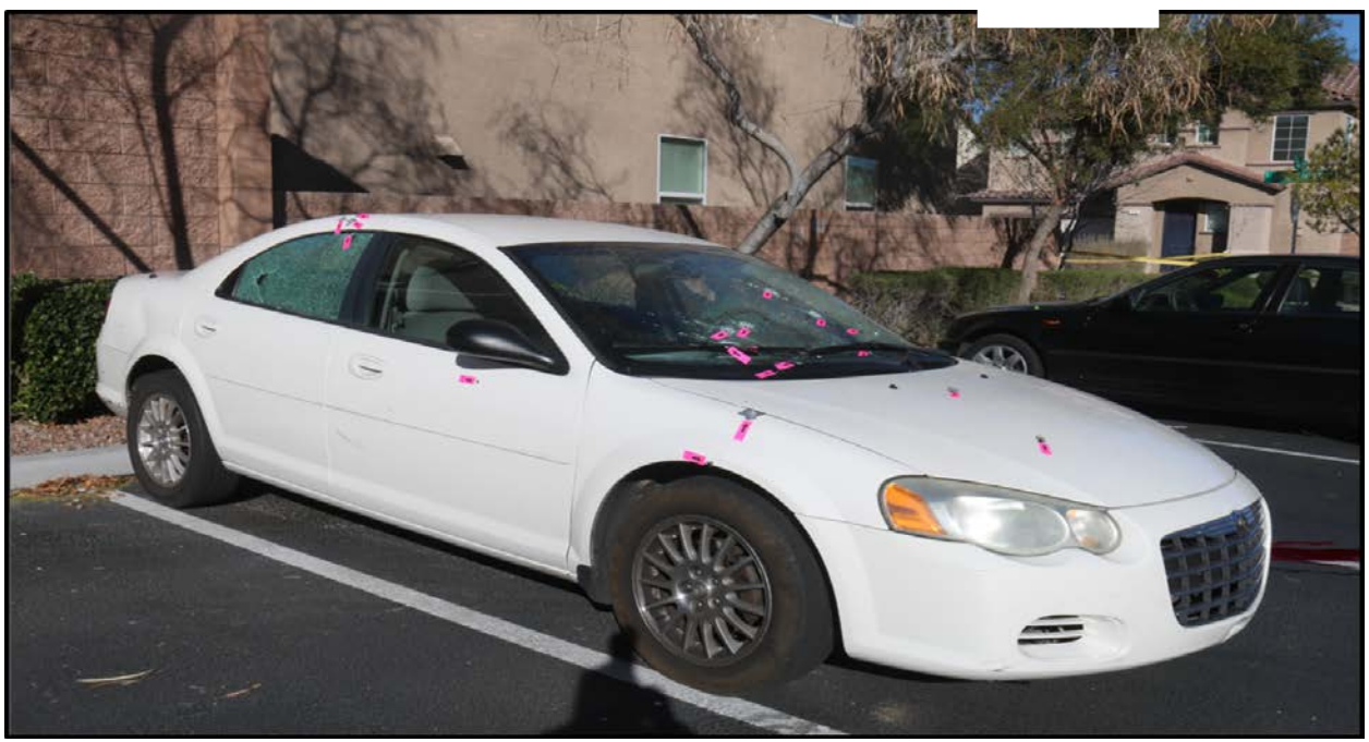
Photograph of Decedent's vehicle after the incident.

Decedent's vehicle had apparent bullet holes, defects and ricochets to the windshield, hood, right front quarter panel, right front passenger door, right rear passenger window, right rear passenger door and roof above the door, and the driver and left rear passenger windows.