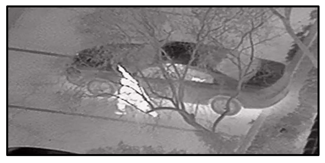
Still from AIR2 FLIR mode camera showing Decedent's position and where his firearm is located right before he is fatally struck in the head by Officer Raymond's rifle shot. The firearm is aimed at officers' location.