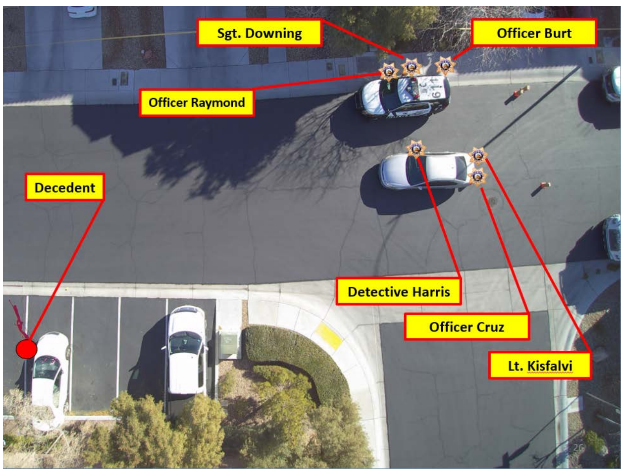
Overhead photograph of the scene with position of witnesses, Decedent and involved officers during the incident.

The scene for this incident was located in a parking lot west of the residence at 11636 Elcadore Street. Elcadore is a north-south street. The parking lot was bordered on the north by Joy Ridge Court and on the south by Fern Tree Court. Civilian witness A.R.'s residence bordered the west side of the parking lot.