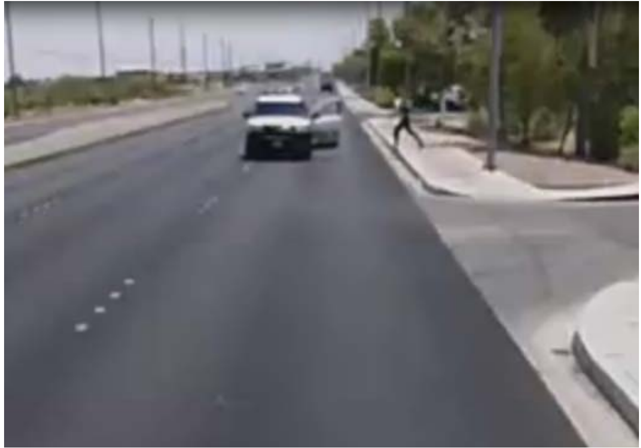
(video still from the CAT BUS)

During the officer-involved shooting, a CAT BUS was driving southbound on N. Rancho Drive. In the video obtained from the CAT BUS, a marked LVMPD patrol sport utility vehicle (SUV) was observed driving northbound in the southbound lanes. The emergency lights were activated and the driver's door was open. Decedent ran northbound on the west side of N. Rancho Drive. Decedent then suddenly turns to his right and runs towards the LVMPD SUV. Decedent ran in front of the open door to the driver's quarter panel. Decedent then ran around the open door towards the driver's seat. Decedent then fell to the ground.