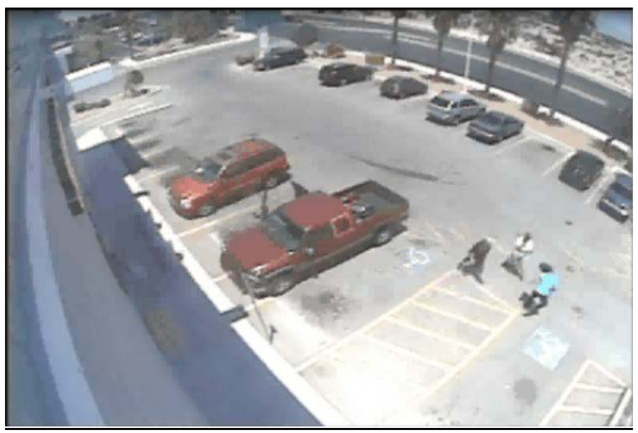
(video still from the SuperPawn located at 4111 N. Rancho Drive)

After Decedent fled the parking lot, one of the remaining two occupants of the truck alerted the SuperPawn employee, who was still on the phone with 9-1-1, that Decedent tried to rob them with a knife. The SuperPawn employee relayed that information to the 9-1-1 operator.