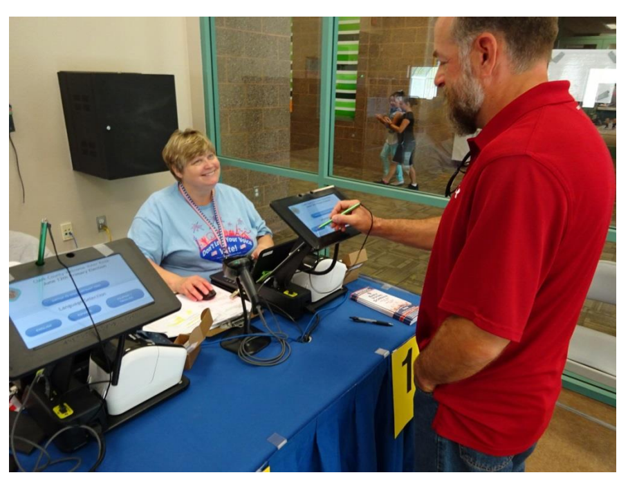
2018 General Election Day Tuesday, November 6, 2018 – 7:00 a.m. to 7:00 p.m.

Candidates who receive the most votes in a General Election are elected to office. If you already voted during the General Early Voting election cycle, you do not need to vote on Election Day. Attempting to vote twice is a felony. You may vote for all offices and questions on the ballot for your precinct, regardless of your party affiliation. The contests applicable to your precinct will appear in the order you will see them on your actual ballot. In General Elections, ballot questions for which you are eligible to vote will also be included.