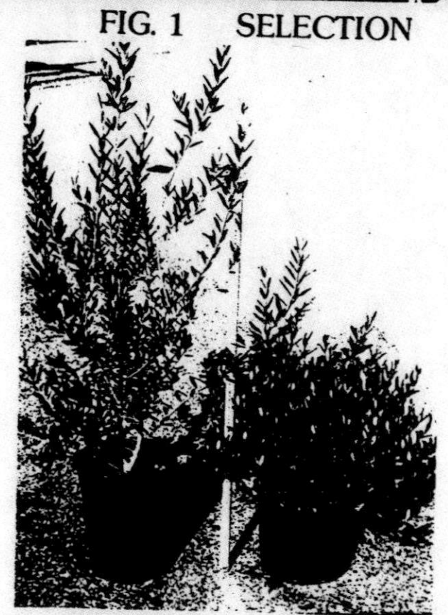
FIG. 2 PRIOR ART & SELECTION