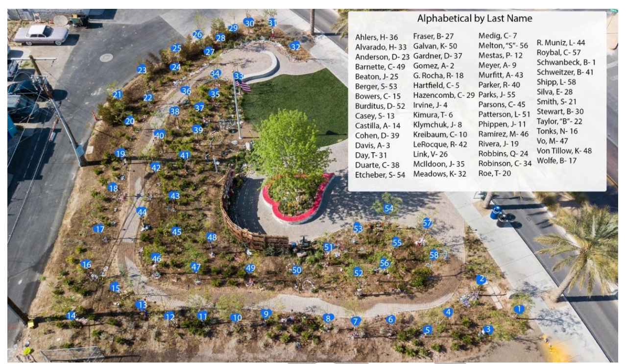
Las Vegas Community Healing Garden Tree Map