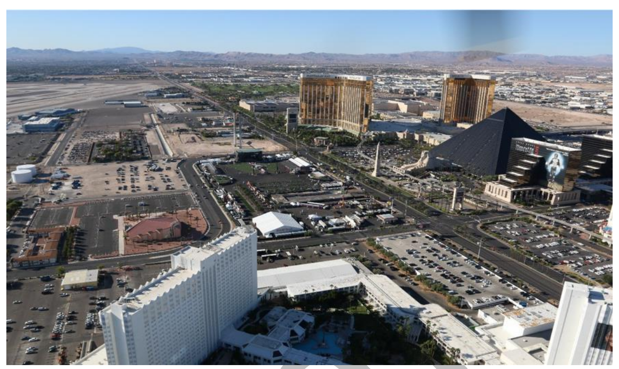
Overview of Scene Locations