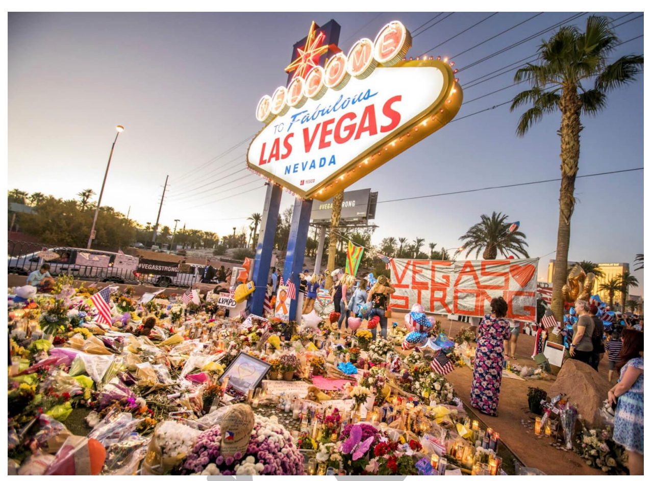
10ctober Remembrance