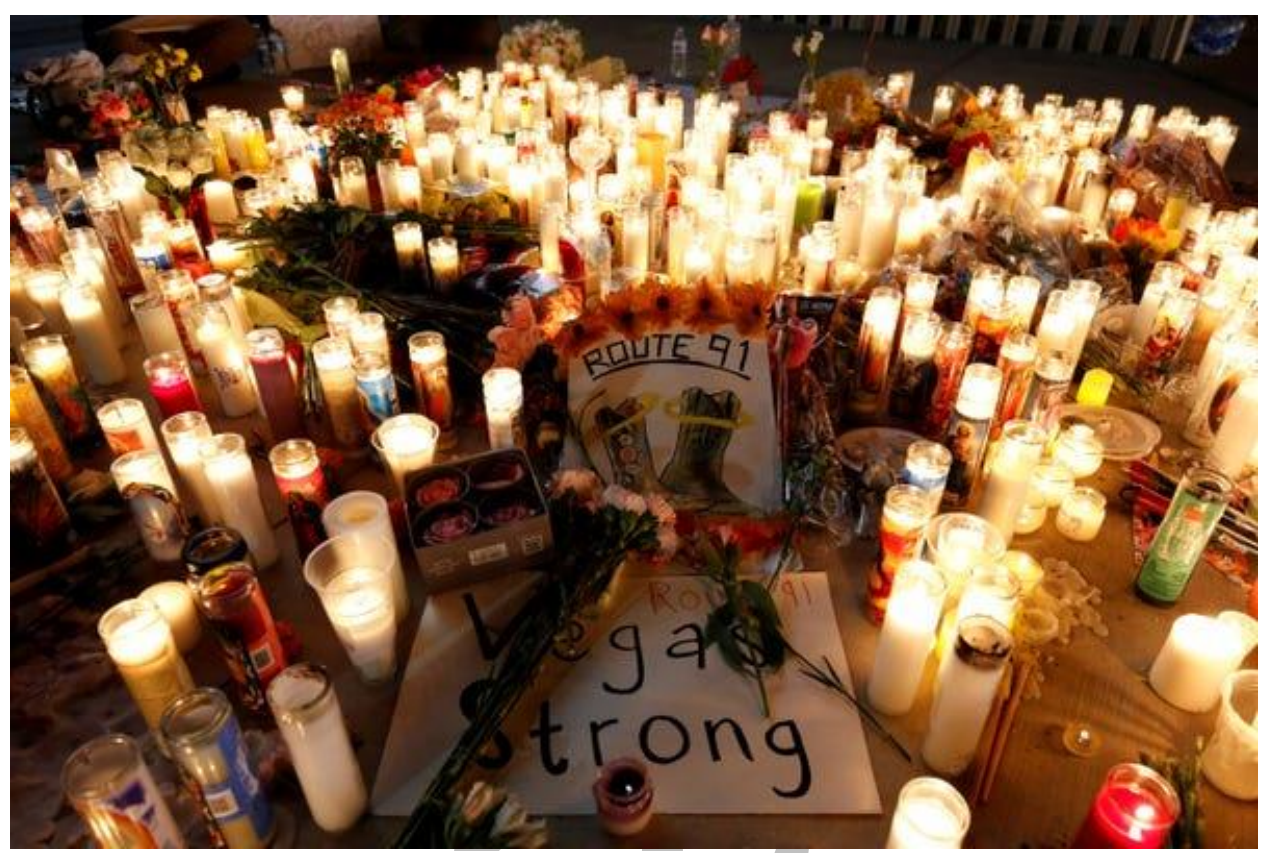
A candle-lit tribute to the victims of the shooting