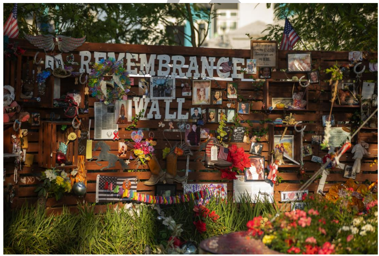
Remembrance Wall in the LV Community Healing Garden, photo from City of Las Vegas