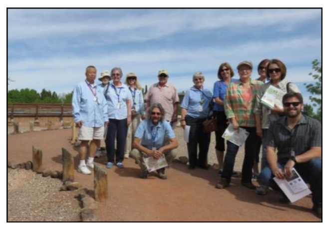
Wetlands Park volunteers on a "Volunteer Venture."

Most of all, you'll be part of a team of dedicated staff and volunteers who work together for the benefit of Wetlands Park, and have fun doing it!