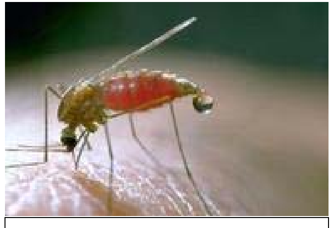
Female mosquitoes only take a blood meal!