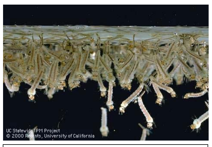
Culex mosquito larvae