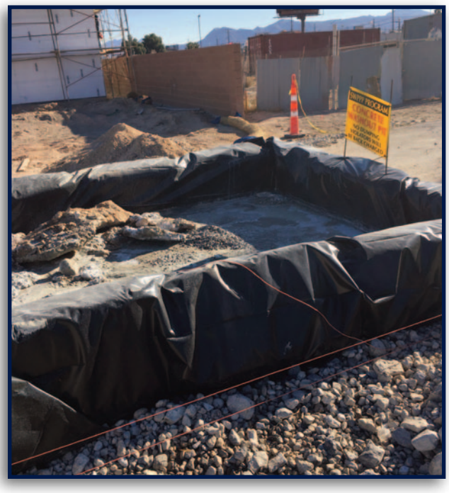
A well-maintained concrete washout area.

off chutes, equipment and concrete truck exteriors. Concrete washout is a slurry containing toxic metals (e.g., chromium, copper, and iron), and it should never be disposed of on the ground or into nearby storm drains. If possible, all concrete waste and washwater should be returned for proper disposal at the concrete batch plant. If this is not possible, operators can install an on-site concrete washout bin. The purpose of a concrete washout bin is to properly store construction waste materials to prevent transport off-site and minimize contact with stormwater. The container must be leak-proof and cannot allow the waste materials to contact the ground. Rainfall may cause overfilled concrete washout containers to overflow and transport the washwater to Lake Mead.