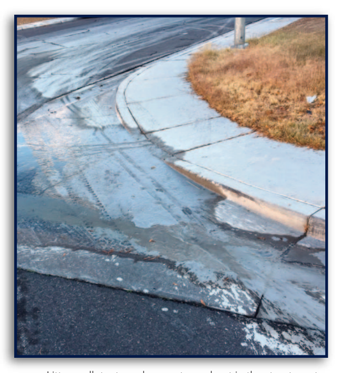
Litter, pollutants and concrete washout in the streets, enter nearby storm drains and get carried untreated to Lake Mead.