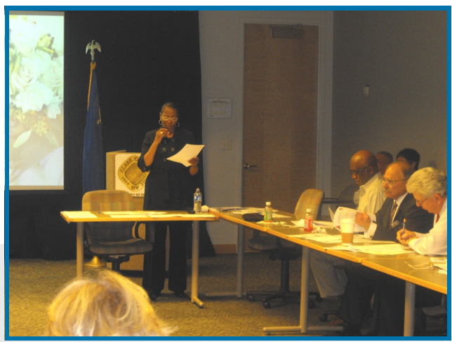
Recorder Conway hosted a meeting for marriage officiants throughout the County to ensure proper completion of marriage certificates.